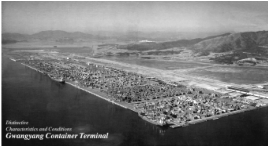
Korea's newest port will triple the nation's South Coast freight capacity, and serve as a "Gateway of the Iron Silk Road" which will connect through Trans-Korea rails to the continental railways of Russia, China, and Europe.

of actual freight in 2003, an under 50% capacity utilization. Many doubting Thomases said funds should be focused in Busan alone, and that it was foolish to build two ports which would only compete with each other. Others, with reverse logic, praised such a competition as a way for shippers to get rock bottom prices by underpaying the workforce and the port authority. Many speakers focused on cost statistics, debating which of the many ports in East Asia could chisel its prices down most cheaply.