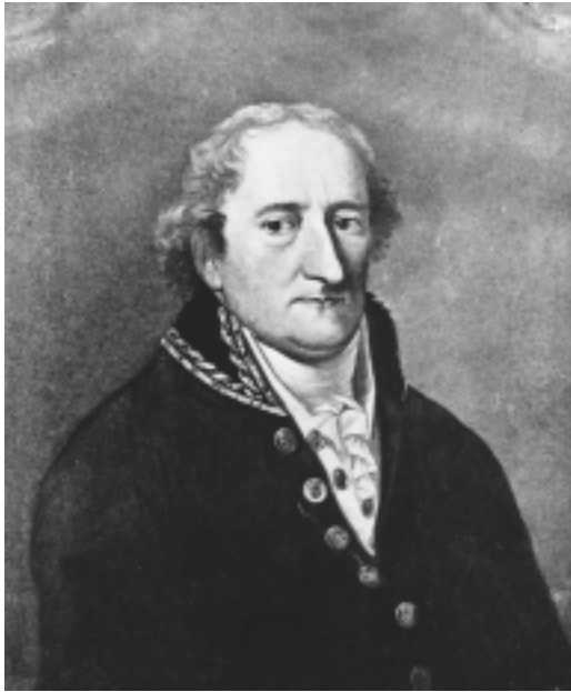
Carl Friedrich, Freiherr vom Stein (left) and Wilhelm von Humboldt led the fight in Germany against entrenched feudalism.