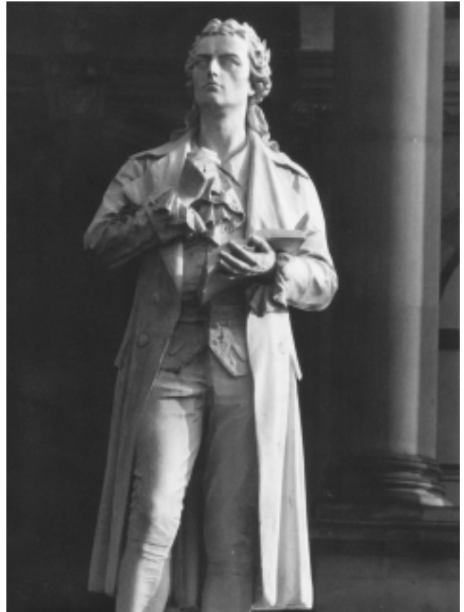
Friedrich Schiller, Germany’s “poet of freedom,” looked to the American Revolution as a model for what needed to be done in Europe.

Such a conference must take the following measures, in the tradition of the old Bretton Woods System of Franklin D. Roosevelt: A large part of the world’s debt must be reorga-