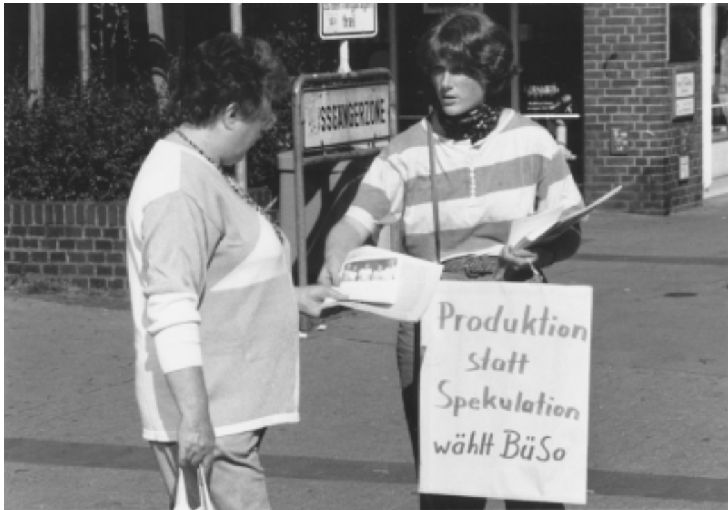
A BüSo organizer during an earlier election campaign. The sign reads, "Production Instead of Speculation, Vote BüSo."