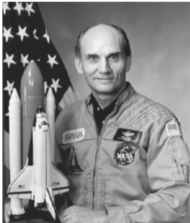
Sen. E.J. "Jake" Garn.

EIR: What the President has in the budget is an allocation of $6.6 billion over five years to develop the crew exploration vehicle, to replace the crew-carrying capability of the Shuttle. But there is no money to start developing a replacement for the Space Shuttle cargo-carrying capability. Engineers have looked at a Shuttle-derived vehicle—replacing the orbiter with a payload carrier. Why not use the Shuttle technology in