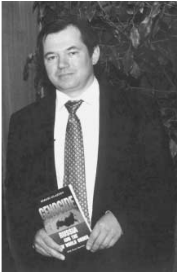
Russian economist Sergei Glazyev, shown here with his book Genocide: Russia and the New World Order , is a Presidential candidate and former Minister of Foreign Economic Ties.