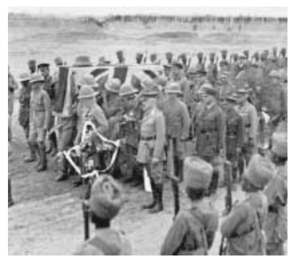
After a British invading army had been beseiged and surrendered in 1916, the second British invasion of Iraq, in 1917, "succeeded" because the Ottoman Turkish imperial regime had meanwhile fiercely oppressed Iraq's Shi'ites, generating great opposition to Ottoman Rule. British Maj. Gen. Stanley Maude's troops finally captured Baghdad on March 11, 1917 (left). Maude was to be buried under the city's wall seven months later (right).

Turkish portion of the present Ottoman Empire should be assured a secure sovereignty, but the other nationalities which are now under Turkish rule should be assured an undoubted security of life and an absolutely unmolested opportunity of autonomous development."