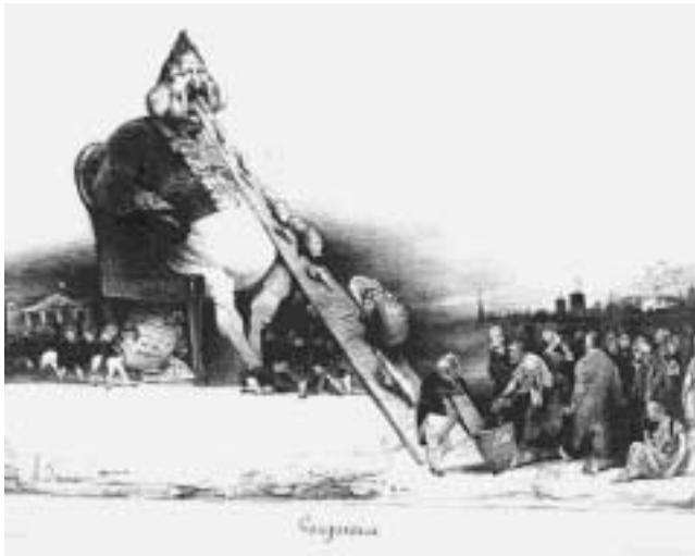
The consumer economy—"It eats your jobs!" Wal-Mart's devouring the economy like the beast in Daumier's 18th-Century cartoon, spreading poverty around it on all sides.

discounts; and a ferocious anti-labor policy keeping wages very low.