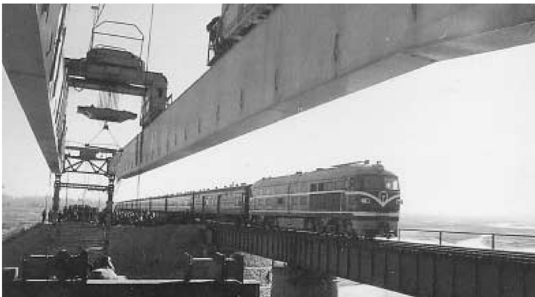
A railway bridge goes up on the second, or Central, Eurasian Land-Bridge in China. Rapid economic development offers a potential principle of mutual advantage among sovereign nation-states—a principle LaRouche proposes to replace the defensive idea of “multipolarity” as against unilateralism.

We may regard the often-expressed proposal to establish “a multipolar world,” as, in and for itself, an understandable rejection of the imperialist intent expressed by certain circles currently occupying key positions in the government of the U.S.A. Since the 1989-1992 collapse of the Soviet Union, those circles have foreseen what they have expressed as belief in the opportunity to create a global “American,” or “Anglo-American” empire. They have declared their intention to create such an empire, otherwise identified as “world government,” by means of revival of Bertrand Russell’s 1940s doctrine of Anglo-American “preventive nuclear warfare.” Russell’s original threat ended, for a time, with the successful Soviet testing of a thermonuclear weapon-prototype; that threat has been revived by U.S. Vice-President Cheney and others, as official U.S. policy, in the aftermath of the shocking events of Sept. 11, 2001.