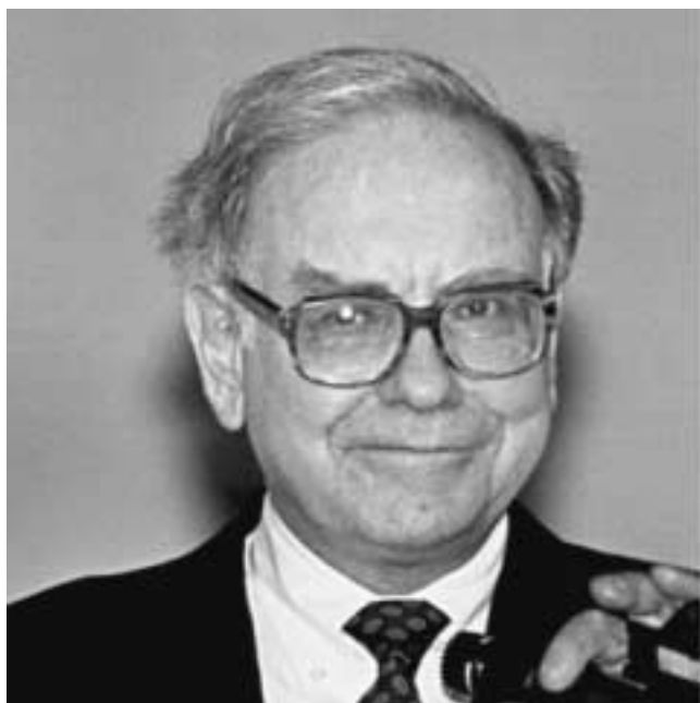
Warren Buffett, chief among the financiers using the Schwarzenegger Recall hoax to go for another round of looting of California. In Buffett’s case, newly acquired gas pipelines are key.

A Reuters wire described the Aug. 7 Administration order: “The BLM will be asked not to unduly restrict access to