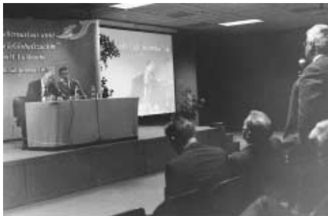
On Nov. 5, 2002, Lyndon LaRouche proposed the common infrastructure “economic driver” program for the Southwest United States and Mexico, at an address videoconferenced to Mexican universities from the University of Coahuila at Saltillo.