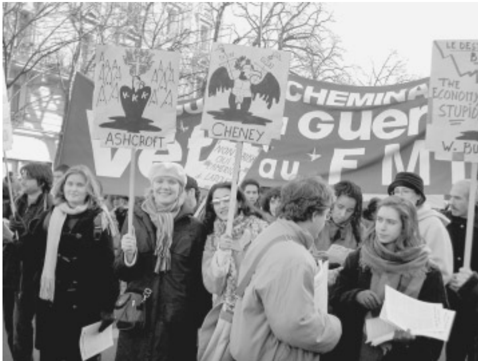
LaRouche Youth Movement organizers in the huge Feb. 15 demonstration in Paris; their large banner reads “War against the IMF.” “But, this is a revolution! I mean, when has this ever happened—that before a war breaks out, millions are taking to the streets?”

India; and many small countries dared to speak up.