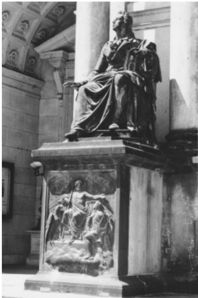
Friedrich Schiller’s statue in front of the Dresden Opera House. “The reason I gave the Schiller Institute his name . . . is because it is my view—and I have read many philosophers, poets, from many cultures—but I still hold, that he represents the highest principle of humanity. That he has more beautifully presented a poetical image of what man can be, than anybody else.”

Wilhelm von Humboldt wrote about this, “The confidence in the efficacy of the power of the human mind, elevated into a poetical image, is expressed in this distich, entitled Columbus , which belongs to the most characteristic Schiller