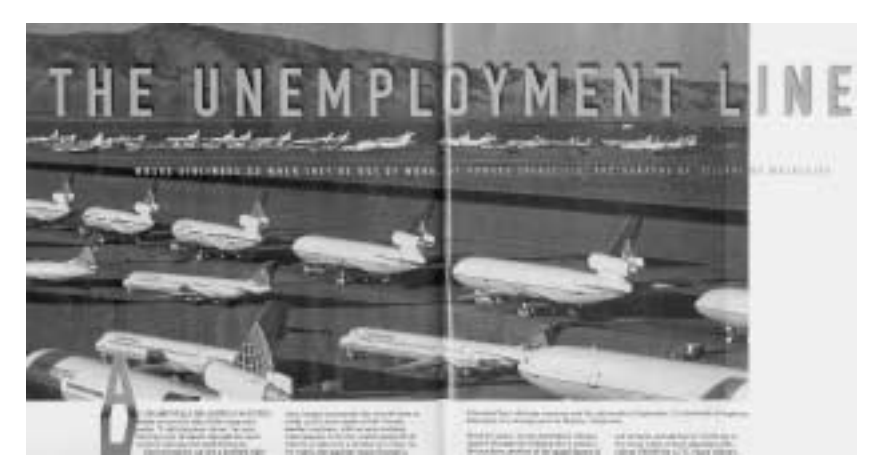
A feature story in Air & Space magazine, September 2002, shows airplanes warehoused in a storage yard in Mojave, California. As of August, shrinking airlines may have "laid off" nearly 1,000 jets, as well as 200,000 employees.

cities in the South multiple connections to the entire East Coast. A Northeast Corridor Authority could manage both the air and rail transportation, regulating flight and train routes and prices, to maintain a full service schedule and utilization of facilities, as well as integrating local travel connections from train stations and airports. Family and group fares can allow planes and trains to offer the same economy in transporting four passengers for the cost of one, that a car does.