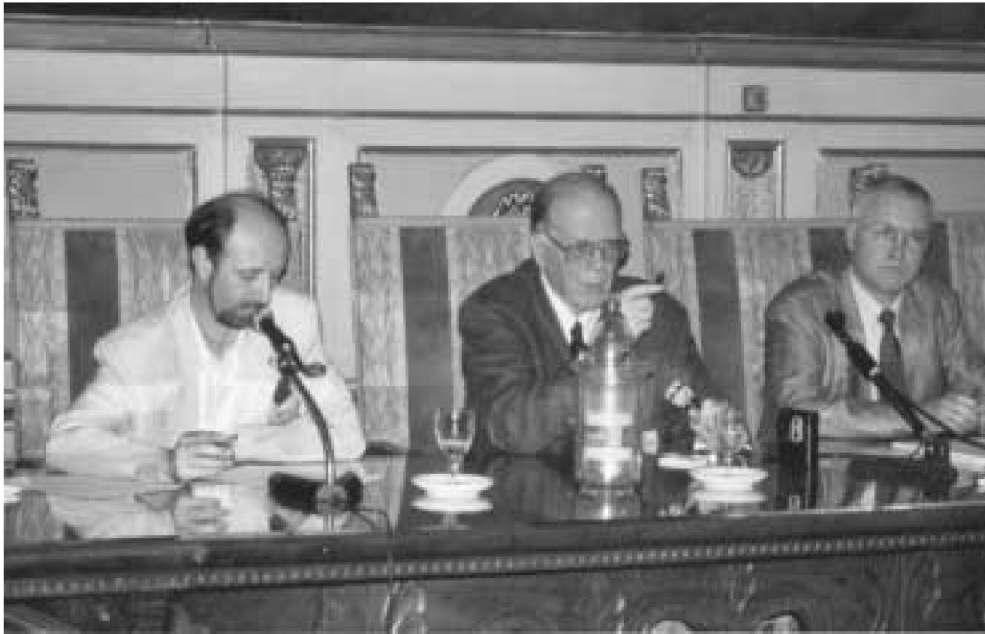
LaRouche speaks on the “dialogue of civilizations” at a June 2001 conference with business leaders and parliamentarians in Rome, one of his three major visits to the Italian capital in the second half of the year.

tral and South America — have more than repaid the total debt they have ever incurred to this date, but they still have a greater debt than they ever had before. The reason is because of this swindle. When the IMF comes in and says you have to devalue your currency because you have a financial problem or monetary problem, that is a form of rape, and it is precisely that kind of devaluation of the Argentine currency which brought Argentina into the present crisis. So, it’s the worst possible policy you can imagine.