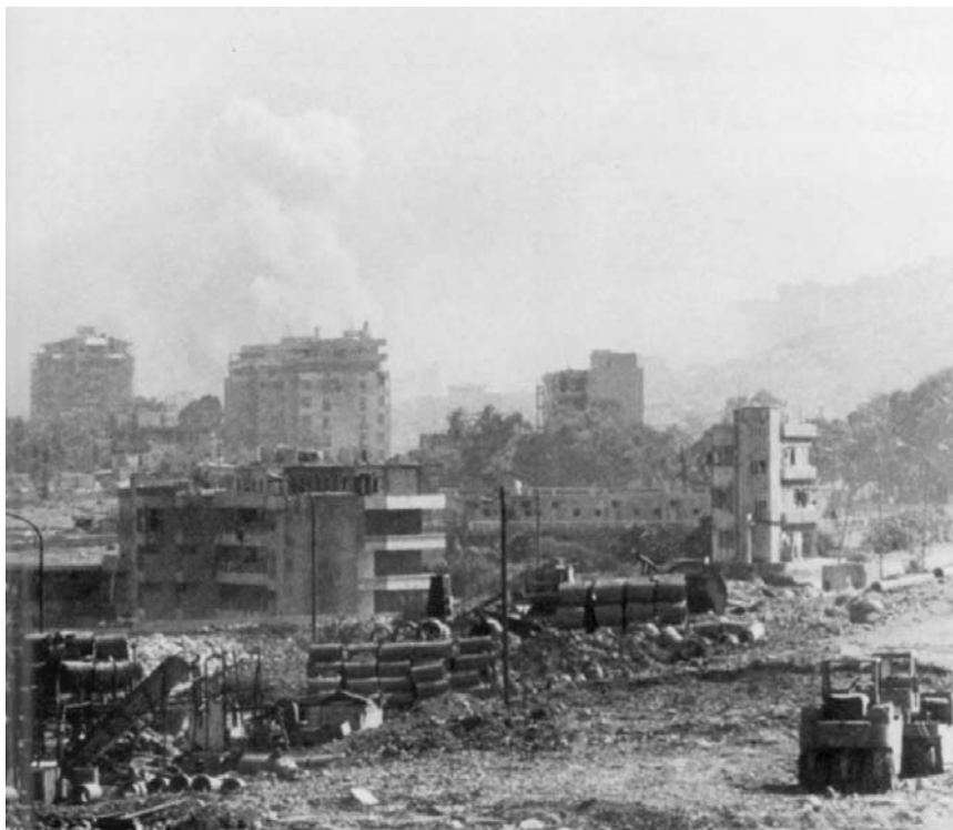
"In his meetings with foreign leaders, Sharon often talks at length about his open account with Arafat going back to the . . . seige of Beirut." Here, Beirut destroyed in 1982. "Sharon," says another commentator, "is now trying to complete [what] he didn't manage militarily 20 years ago."

One has to understand the fanaticism of Sharon, who is replaying his own orchestration of the 1982 Lebanon War, in which, as Defense Minister, he drafted "Operation Pines," claiming falsely that it was to be a limited security operation to eliminate "terrorism" along the Lebanese border. In fact, Sharon launched a full-scale invasion of Lebanon to establish a so-called "Christian" Phalangist state, with its capital in