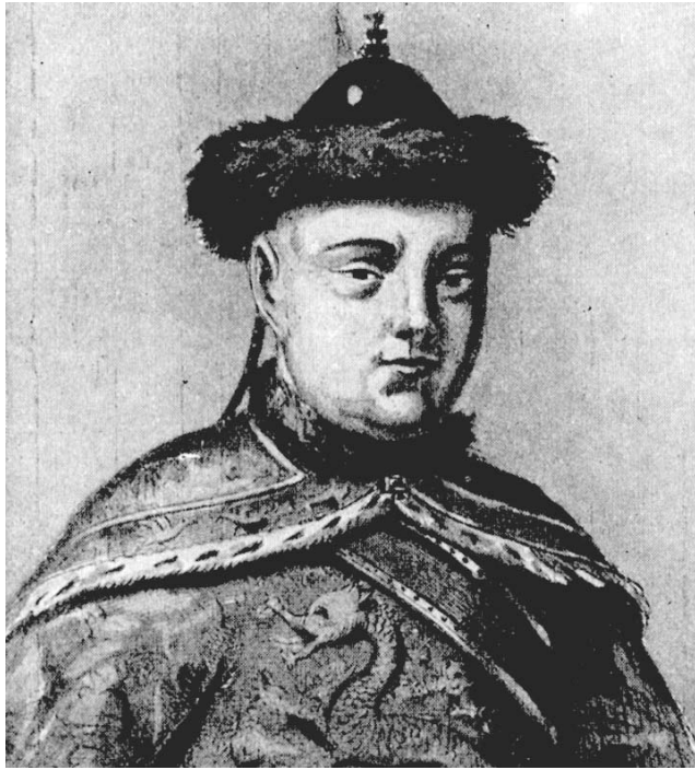
Emperor Kang Hsi. Leibniz referred to him as a monarch “who almost exceeds human heights of greatness, being a god-like mortal, ruling by a nod of his head, who, however, is educated to virtue and wisdom . . . thereby earning the right to rule.”