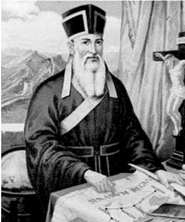
Father Matteo Ricci, whom Pope John Paul II described as “a precious connecting link between West and East, between European Renaissance culture and Chinese culture, and between the ancient and magnificent Chinese civilization and the world of Europe.”

a doctrine of natural theology, venerable by its antiquity, established and authorized for about 3,000 years, long before the philosophy of the Greeks.