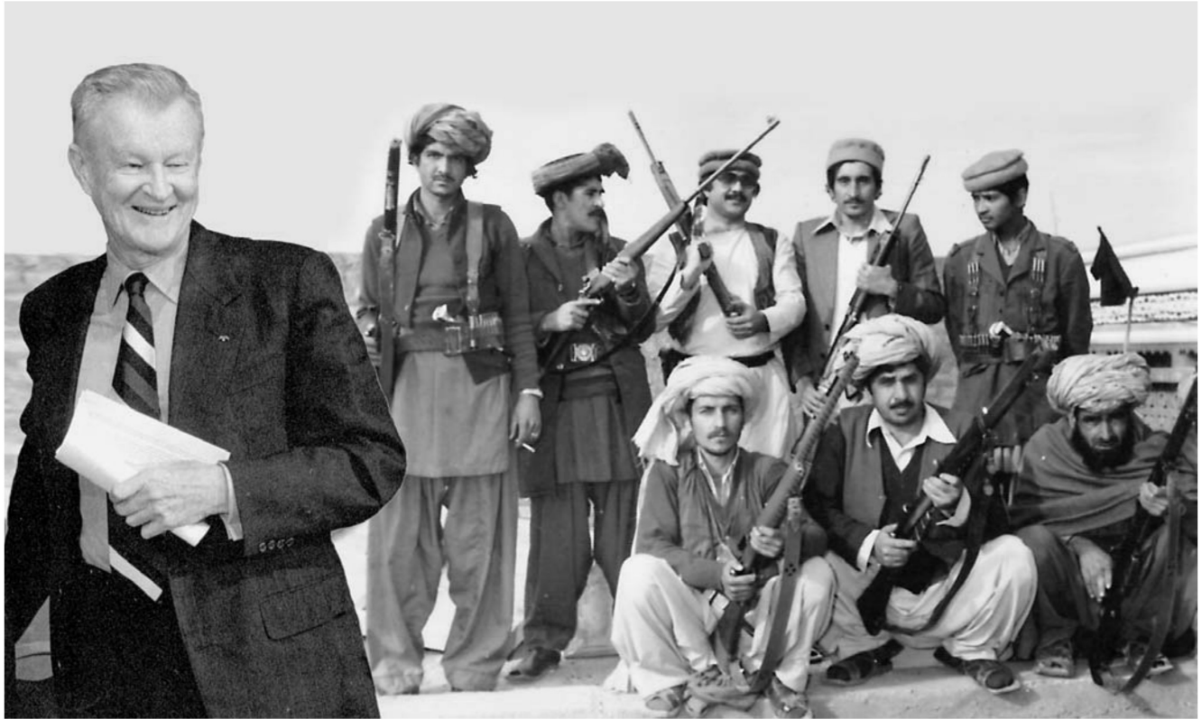
The Afghansi were created on behalf of the United States by Zbigniew Brzezinski, in order to encircle the Soviet Union with an “arc of crisis.” This is the kind of mentality that could have launched the terrorist attacks on New York and Washington.