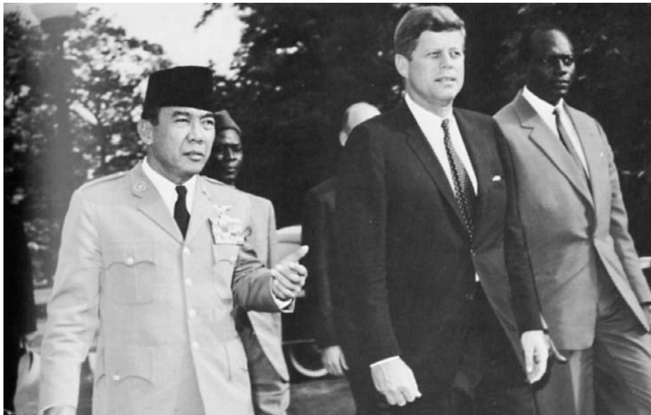
Indonesian President Sukarno with U.S. President John F. Kennedy, in Washington, April 1961. After Kennedy's assassination, American policy toward Vietnam, China, and Indonesia came under control of the British, with disastrous consequences.

and the mid 1960s, stalled only briefly by President Kennedy and his Ambassador to Indonesia, Howard Jones, before Kennedy's assassination. 3