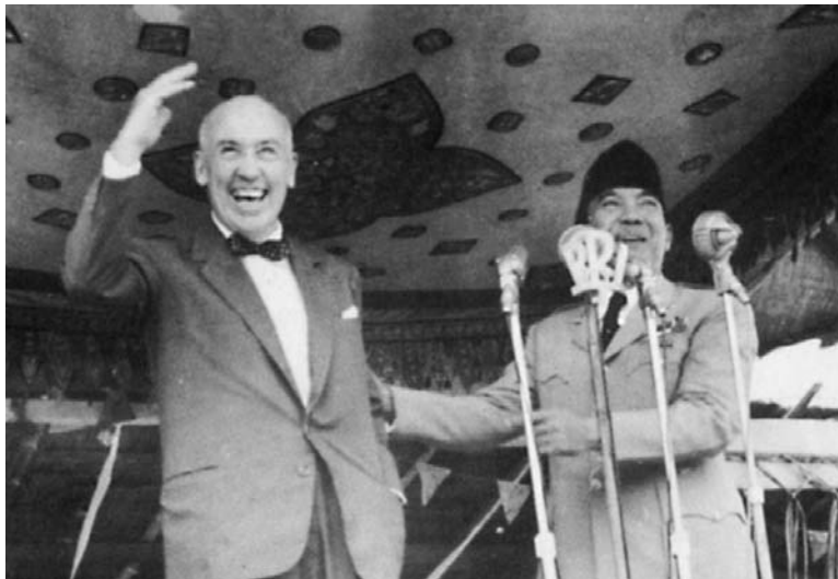
U.S. Ambassador Howard Jones with Indonesian President Sukarno. Jones had an appreciation of Indonesia's history and culture, and for Sukarno personally, whom he (and President Kennedy) considered to be the "George Washington of Indonesia."

ese side of the war. An extremely useful and revealing dialogue ensued. 29 McNamara, however, desperately tried to distort the original global purpose of the war, by insisting that it was all simply a terrible mistake, a tragedy, based purely on misperceptions, by both sides, of their adversary's true goals and intentions. Vietnam's hero of both the French and the American colonial wars, Gen. Vo Nguyen Giap, although equally unaware of the global Pugwash motivation of the American war, most eloquently refuted "Mr. Body Count" McNamara's perspective: "You are wrong to call the war a 'tragedy'—to say that it came from missed opportunities. Maybe it was a tragedy for you, because yours was a war of aggression, in the neo-colonial style or fashion. . . , so, yes, it was tragic, because they died for a bad cause. But for us, the war against you was a noble sacrifice. We did not want to fight the U.S. We did not. But you gave us no choice. . . . There were no missed opportunities for us. . . . I think we would do nothing different, under the circumstances."