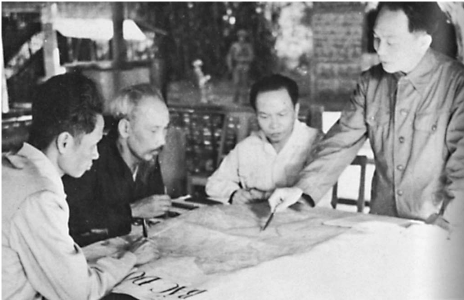
Ho Chi Minh (second from left) in 1954. U.S. Ambassador Nolting recognized that Ho admired the United States, and that he considered himself a nationalist first, and a communist second. Getting Nolting out of the way was a top priority for Harriman and company.

clearly possible to continue our support of South Vietnam through its legitimate constitutional government or to withdraw .” 14