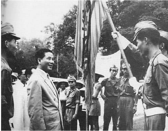
South Vietnamese President Ngo Dinh Diem was assassinated in 1963, because of his refusal to give up national sovereignty to the Averell Harriman crowd in the United States, and his effort to prevent a full-scale war in Vietnam. He is shown here in 1955.