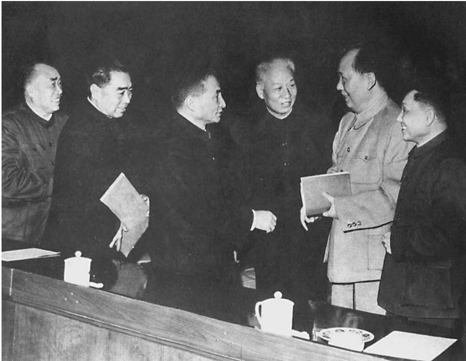
Chinese Prime Minister Zhou Enlai (second from left) with other members of the Chinese leadership (Mao Zedong is second from the right). Zhou was educated in the tradition represented by Sun Yat-sen, and his own philosophical outlook drew upon the 17th-Century Confucian philosophers Gu Yanwu and Wang Fuzhi. His study of Western ideas, including Marxism, was grounded upon this moral foundation.

But when Zhou's 1954-55 initiatives, and the promise of the U.S.-China discussions following Bandung, were countered by increased covert and overt Cold War operations by London and Washington against China and her allies in Indonesia and elsewhere, Chinese Communist Party (CCP) Chairman Mao Zedong's reaction was to adopt a Romantic revolutionary posture, a process repeated several times during the long and contradictory era of Mao's leadership over the CCP and the Chinese nation. The Great Leap Forward, for instance, launched in 1958, attempted to extend the ideas associated with Mao's concept of "People's War" into running the economy. People's War depended upon the mobilization of the population, the "masses," for highly localized guerrilla warfare, rather than the conventional concentration of professional forces for offensive operations. Through a protracted defense, People's War aimed to submerge a larger and better equipped adversary in the "sea of the people." The collectivization of agriculture, the infamous backyard steel plants, and similar Great Leap schemes, were meant to demonstrate that a People's War approach to economic policy would prove that China could industrialize and modernize without foreign assistance, dependent only on the spiritual and physical will of a politically mobilized population. It was a colossal failure.