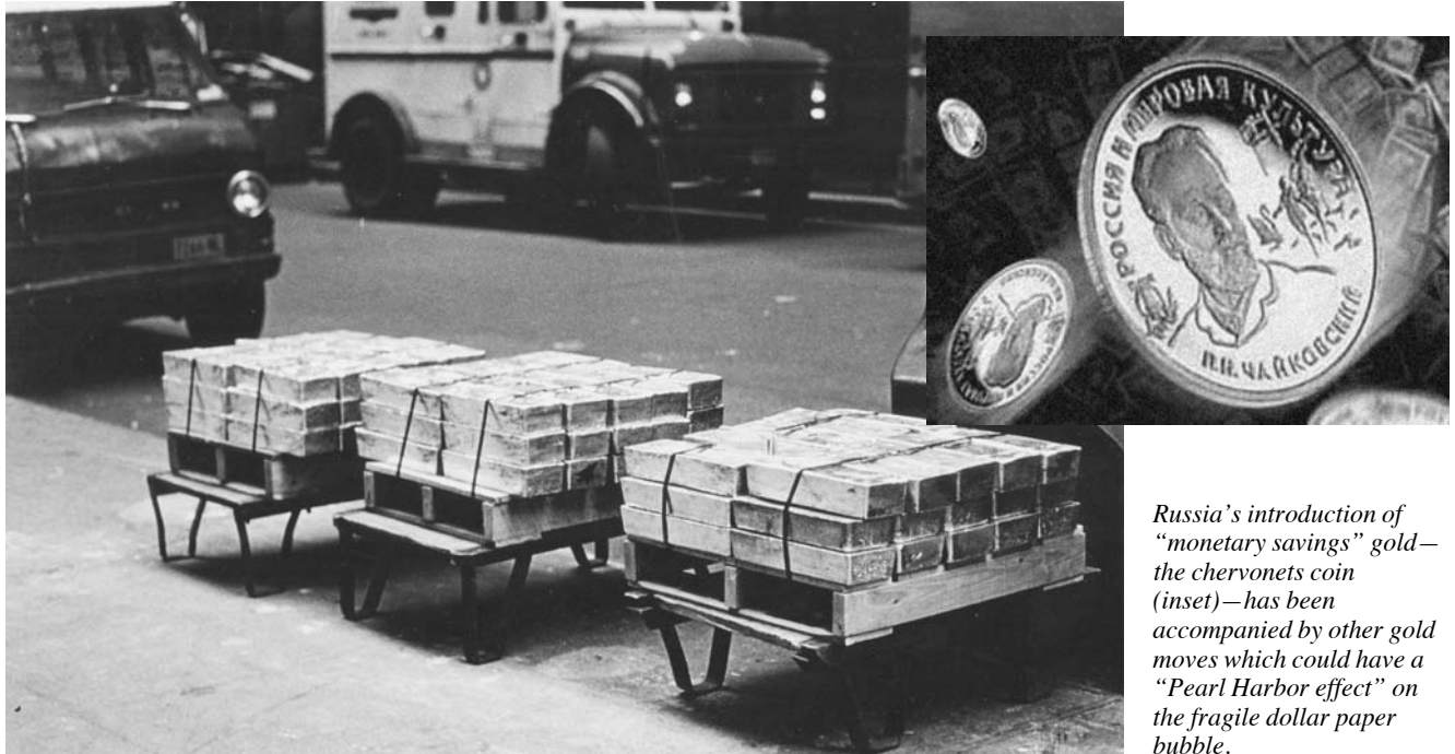
Russia's introduction of "monetary savings" gold—the chervonets coin (inset)—has been accompanied by other gold moves which could have a "Pearl Harbor effect" on the fragile dollar paper bubble.

current exchange rate). "Such investments will be profitable only in the event that world gold prices rise. But, that will apparently happen soon, in view of the crisis tendencies on global financial markets, and pessimistic forecasts about the U.S. dollar," concluded Kiselyova.