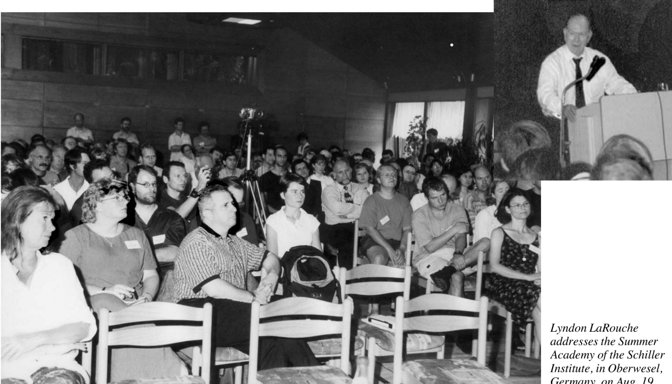
Germany, on Aug. 19.

is of a sensitive and professional quality; it's important. But, at the same time, it's very important that we take on the task of making things clear to general populations and politicians, which are not generally clear to them.