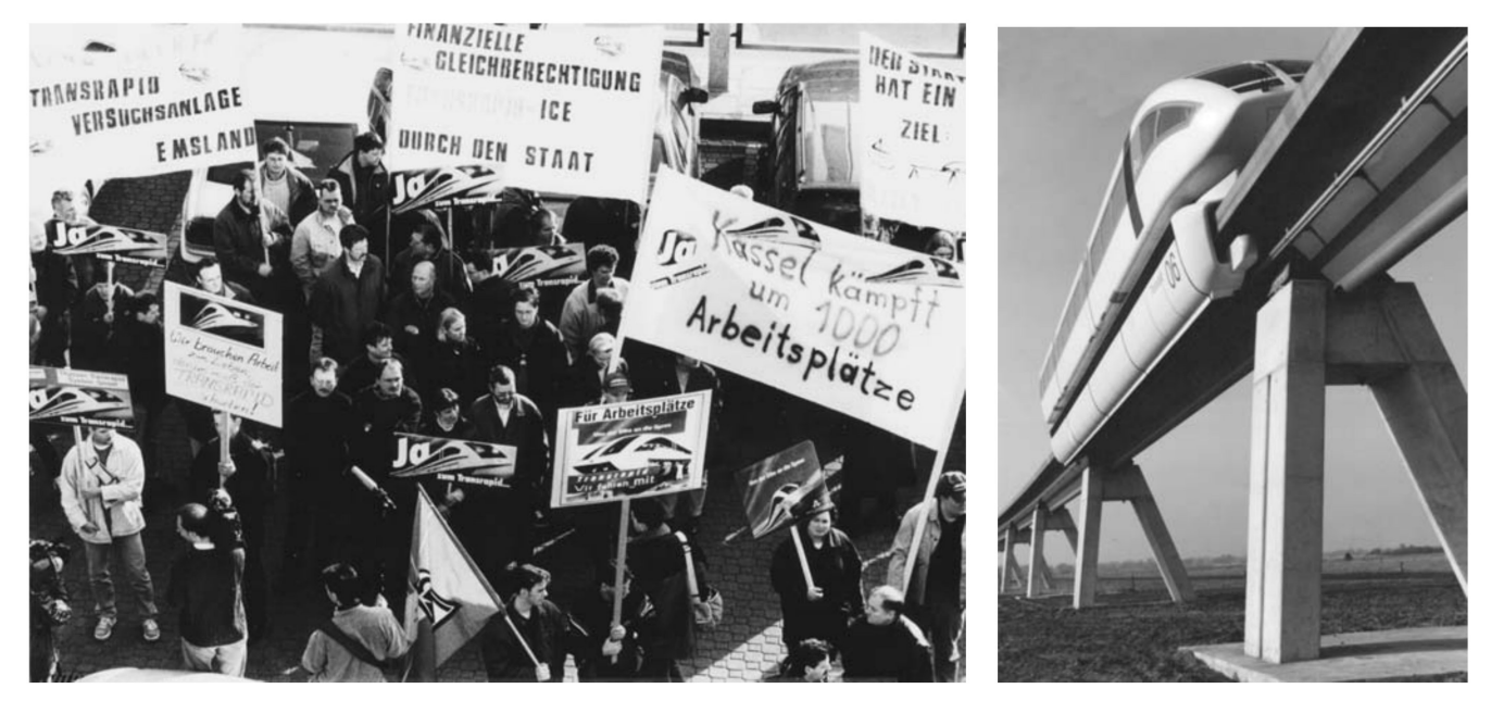
A demonstration at Frankfurt Airport, February 2000, calling on Germany to build the Transrapid maglev system (right). The project was killed in Germany, only to be revived when the Chinese government decided to import German technology to build a maglev system in Shanghai. Such cooperation with Eurasia is the only way for Germany to get out of its economic crisis.

to bring about, the kind of growth, which you need to rebuild these shattered economies in Western Europe.