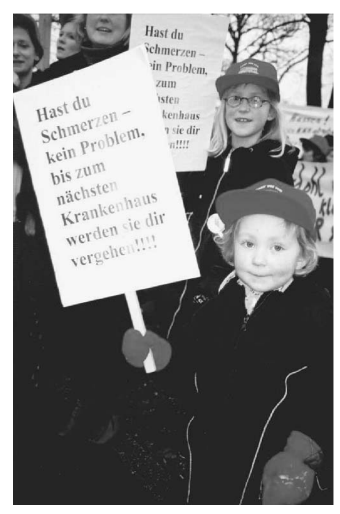
A demonstration against hospital closings in Germany. The signs read: "Are you in pain? No problem—until the next time you have to go to a hospital!"

included public housing, went into the "private sector," becoming an executive of the GEHAG housing company. GEHAG used to be owned by the city of Berlin, and, like most large housing companies in Germany, had been a non-profit company, until non-profit status was legally abolished in the early 1990s.