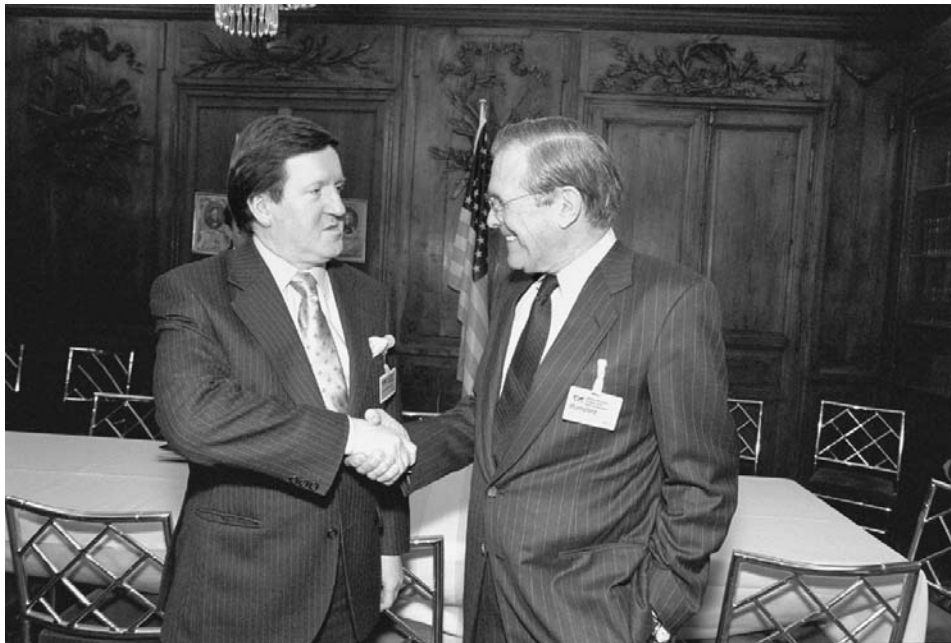
Secretary of Defense Donald Rumsfeld (right) shakes hands with British Defense Secretary Geoffrey Hoon, at a meeting during the Wehrkunde conference in Munich on Feb. 3.

crease in U.S. defense spending—not this year, and not in next year’s budget either. . . . A well-placed Administration official says Rumsfeld ‘didn’t know this was coming.’ ”