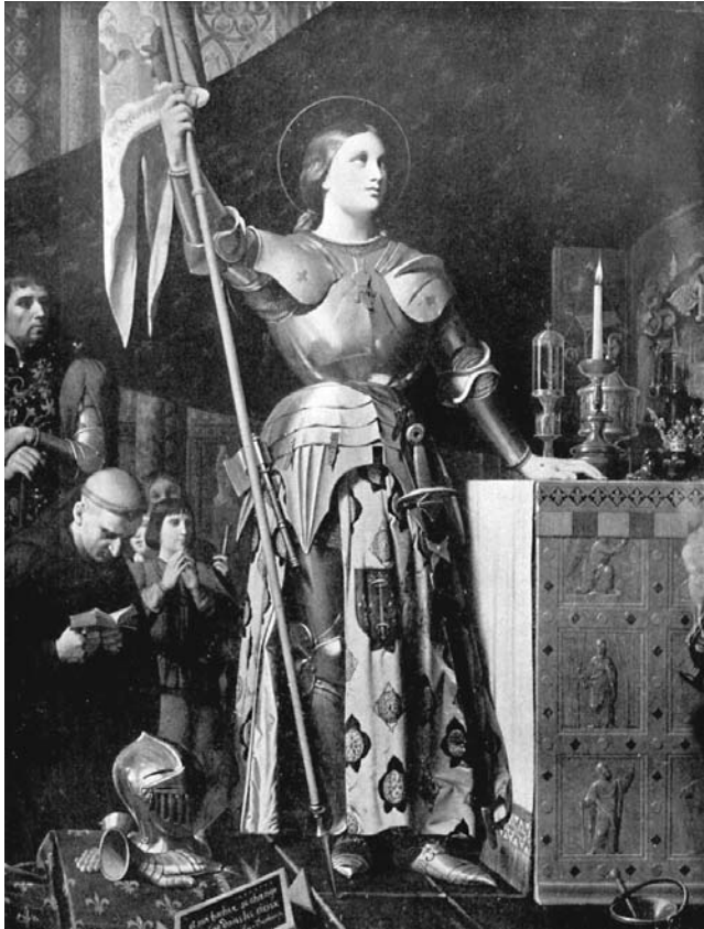
Joan of Arc at Rheims, painting by Ingres, at The Louvre in Paris. In Schiller's play, the story of Joan's (Johanna's) heroism shows that "if you take the divine will as your own, if you become the instrument of world history, you can intervene and change it."

the beginning of death. Life exists for death's sake."