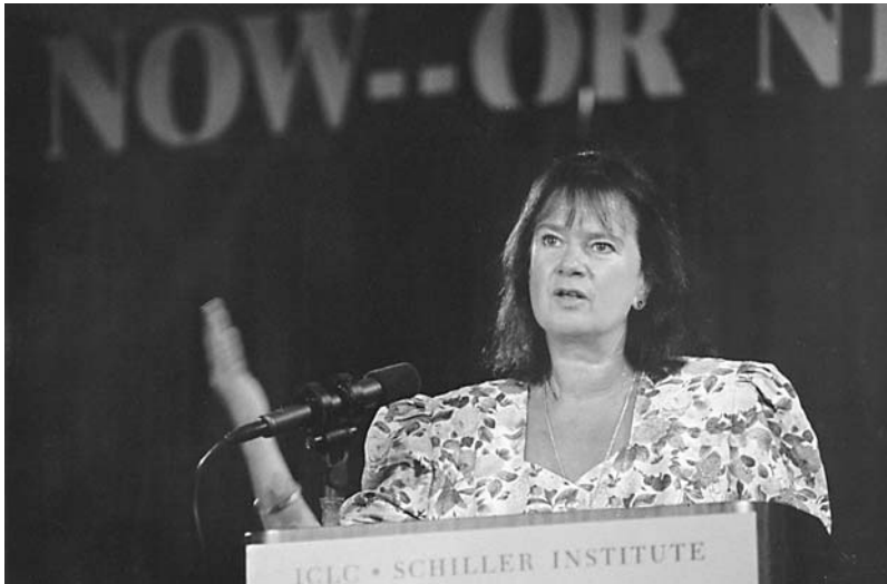
Helga Zepp-LaRouche, founder of the Schiller Institute. The Romantic movement, she argues, was an oligarchical deployment to destroy Classical culture—and to drive people crazy. Its effects can still be seen today, in the degraded nature of Western popular culture.

“It is in the best interest of all countries to support global initiatives to control infectious diseases. Any segment of society that ignores the spread of infections among its neighbors, does so at its own peril. When a country becomes a weak link in the chain of global surveillance and disease control, everyone is affected. . . .