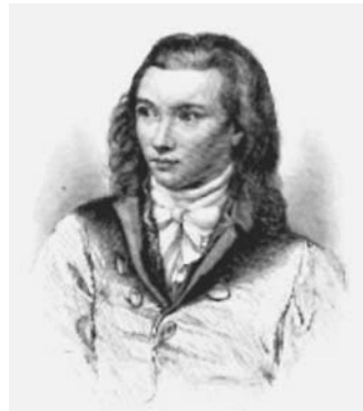
Friedrich Freiherr von Hardenburg (Novalis)

August Wilhelm vacillated between his efforts to propitiate Goethe for his own purposes, and to join the attack on the Classics, but he was already in the process of accepting Romantic ideas. Friedrich completely went along with Novalis, and later converted to his own strange brand of Catholicism, on this basis. Schlegel never wrote poetry, but from 1801 to 1804 he read lectures in Berlin about the history of Romantic literature. Essentially, they attacked the Classics and praised all poets who followed neither the rules of the Greeks nor those of the French. Schlegel naturally glorified the German Middle Ages, the "Minnesänger" and the Nibelungenlied . He indeed