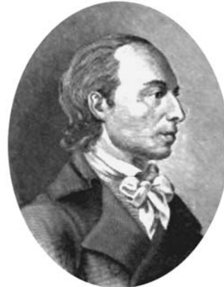
Johann Heinrich Voss

the nobility, and when the question was posed of overcoming feudal class society in practice, he had arguments, which sounded exactly like those of the plantation owners of the Confederacy. The lower class was not yet mature enough to be released, he said, defending the principle of the innate supremacy of the nobility, which he considered a more noble part of mankind, with a sense of honor totally its own, much above the low-level thinking of the non-noble classes, and therefore deserving privileges.