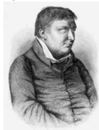
August Wilhelm Schlegel

In the second half of the 1790s, when Schiller and Goethe had started the fruitful decade of their collaboration, a group of young poets and writers gathered in Jena, and in the beginning they were in contact with both Schiller and Goethe. August Wilhelm Schlegel, a student of Gottfried Bürger, whose poetic populism Schiller had criticized so sharply, collaborated for a short period with Schiller’s publications Almanach and Horen . He married Caroline Böhmer, who later left him to marry F.W.J. von Schelling, the “philosopher of nature.” Soon August Wilhelm’s brother Friedrich arrived with his lover and later wife, Dorothea Veit, a daughter of Moses Mendelssohn, who unfortunately did not walk in her father’s footsteps.