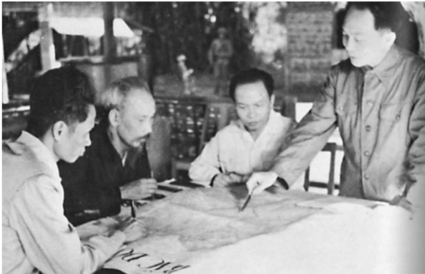
Vietnamese leaders in 1954, left to right: Pham Van Dong, Ho Chi Minh, Truong Chinh, Gen. Vo Nguyen Giap. The OSS had been in close contact with Ho Chi Minh during the war, and Ho gave his full backing to the Allies, in the expectation that they would defeat the Japanese and grant independence to Vietnam.