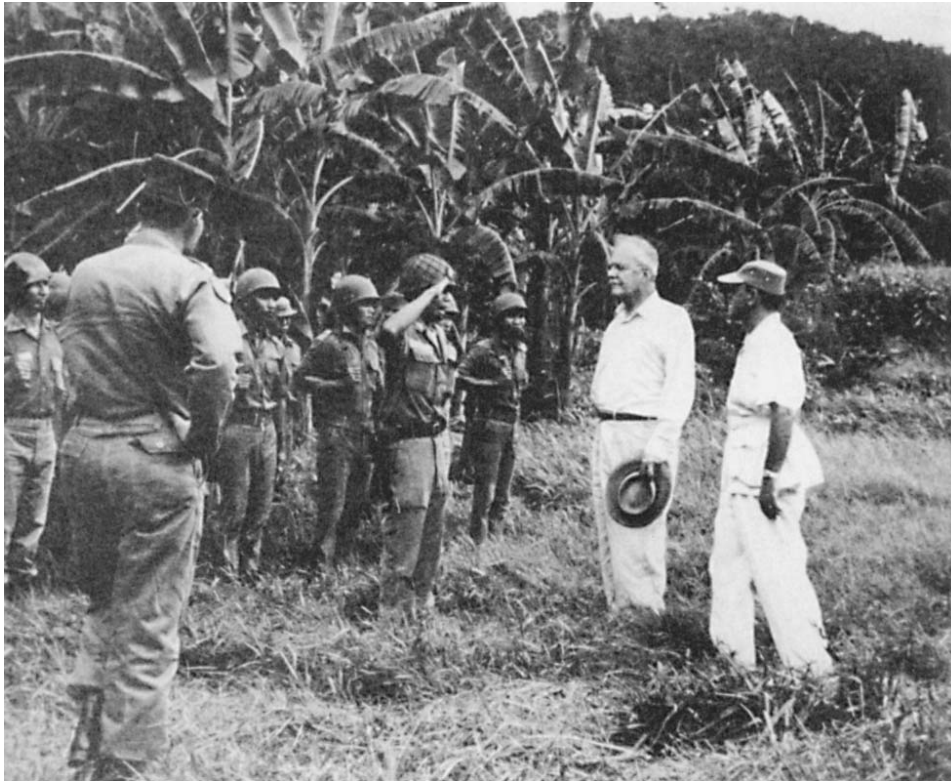
CIA director Allen Dulles in Thailand in 1956 reviews mercenaries hired for combat against China. Under the domination of Allen and John Foster Dulles, during the Eisenhower years of the 1950s, the United States increasingly functioned as an enforcer of a renewed British imperial order.

swept across the border. Truman dumped MacArthur, and a bloody war of attrition set in.