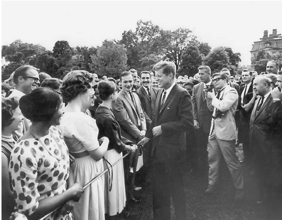
President John F. Kennedy with Peace Corps volunteers. Motivating Kennedy's promotion of programs for Third World development, such as the Peace Corps, was the understanding reflected in his statement to the Democratic Convention which nominated him for President: "More energy is released by the awakening of these new nations than by the fission of the atom itself."

on the subjects of Soviet- or Chinese-sponsored subversion and terrorism. Kennedy had spoken forcefully, in 1951, against support for the "desperate effort of a French regime to hang on to the remnants of Empire in Indochina." 40 A 1957 speech in defense of Algeria's right to independence was roundly denounced in London and Paris, but won the admiration of nationalists everywhere. As his friend and adviser Theodore Sorenson put it, Kennedy "considered communist aggression and subversion as intolerable, but not communism itself." 41 Kennedy told Khrushchev: "What your government believes is its own business; what it does in the world is the world's business." 42