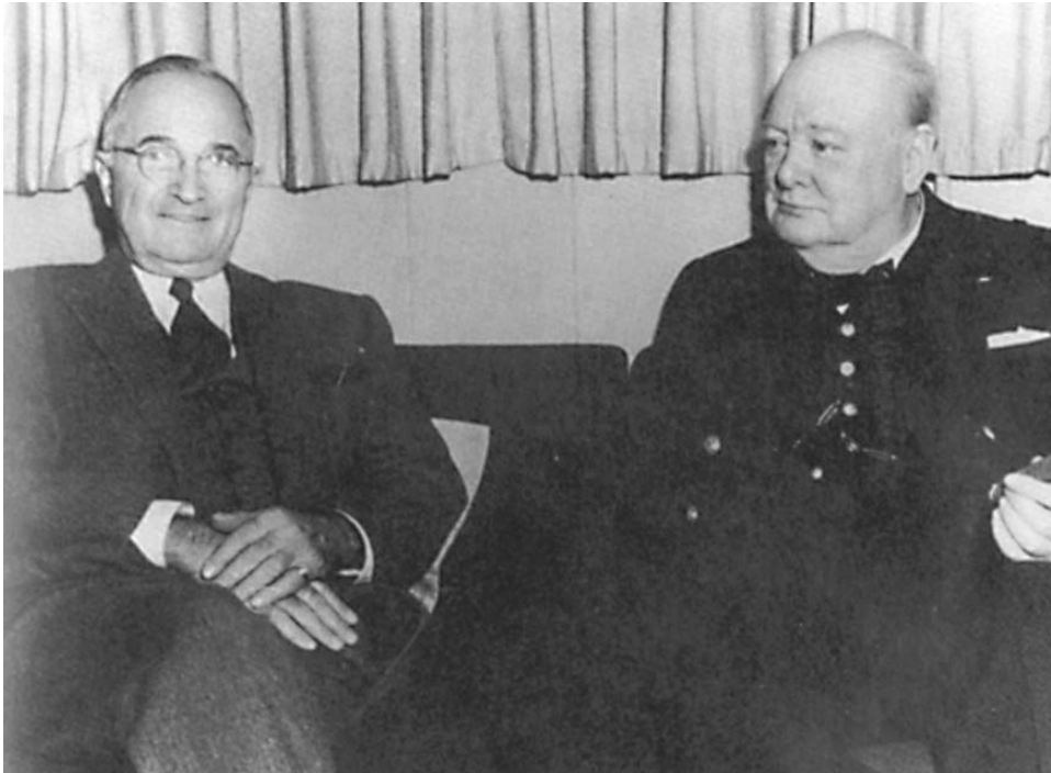
President Harry Truman (left) with Sir Winston Churchill, 1952. After Franklin D. Roosevelt's death, Truman endorsed the recolonization process which Churchill had demanded, and which Roosevelt had so strenuously opposed. But still, the spirit of freedom did not die, as nationalist leaders in Asia continued, for two decades, to look to the United States for support against the recolonizers.

ice and, later, in London, over the course of the sixteenth through the eighteenth centuries. The proponents of the Renaissance world view turned the focus of their efforts and their hopes toward the New World. The American revolutionary victory against the British was supported by, and gave strength to, those who upheld the Greek-Classical tradition in Europe, just as it inspired true nationalists throughout the Third World in the twentieth century.