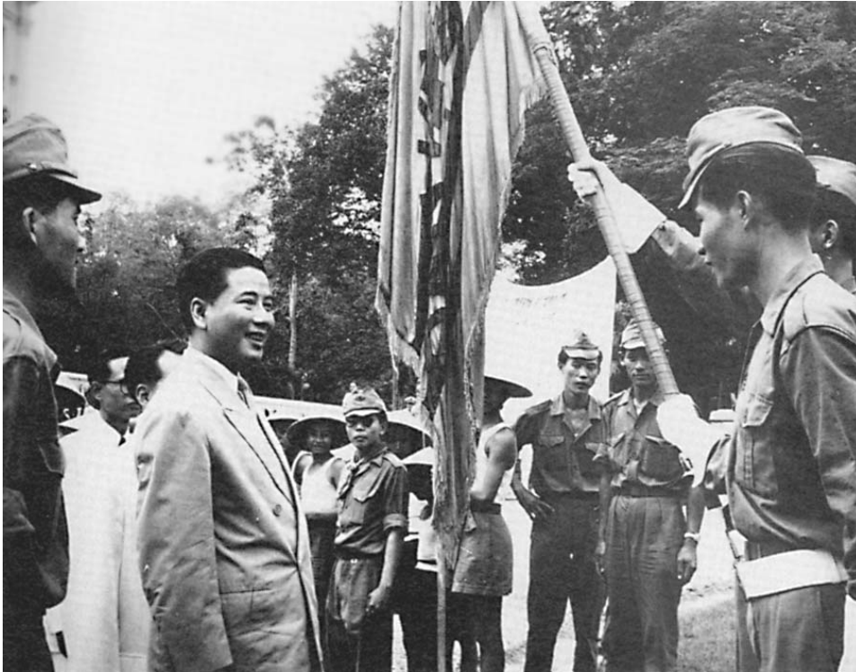
South Vietnamese Prime Minister Ngo Dinh Diem in 1955. Diem was attempting to negotiate an end to the war based on an agreement with Ho Chi Minh and the creation of a neutralist government. Diem was assassinated on Nov. 2, 1963—three weeks before Kennedy's assassination.

would be breaching Vietnam's sovereignty by trying to prevent it.