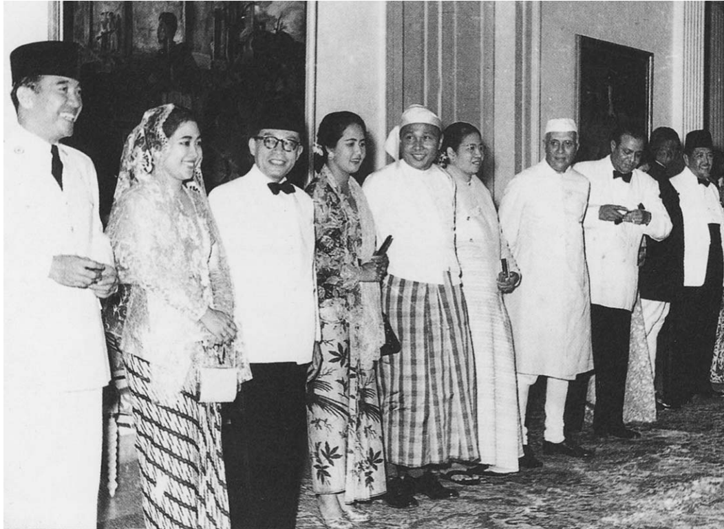
Leaders at the Bandung conference in 1955. From left: Indonesian President Sukarno and his wife; Indonesian Vice President Hatta and his wife; Ne Win of Burma and his wife; Indian Prime Minister Jawarhalal Nehru. Sukarno, in his opening speech, described the conference as “the first international conference of colored peoples in the history of mankind.”

mobilize all the spiritual, all the moral, all the political strength of Asia and Africa on the side of peace. Yes, we! We the peoples of Asia and Africa, 1.4 billion strong, far more than half the human population of the world, we can mobilize what I have called the Moral Violence of Nations in favor of peace.