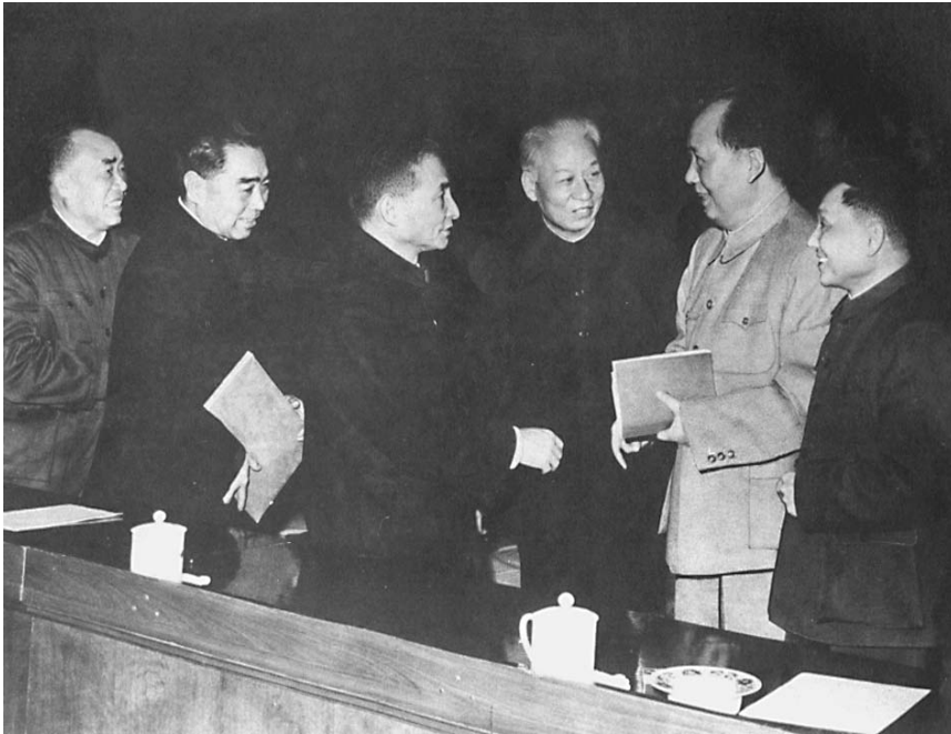
Chinese Prime Minister Zhou Enlai (second from left) with other members of the Chinese leadership (Mao Zedong is second from the right). Zhou's personal leadership role within China was crucial in the move toward establishing normal relations with the West, beginning in 1955.