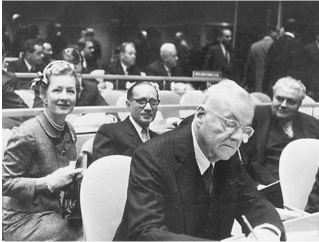
John Foster Dulles, one of Roosevelt's most outspoken enemies. Roosevelt recognized the Dulles version of a United Nations as an apology for the preservation of the European empires.

aration for that conference, developed a plan to send international teams of technicians, doctors, economists, and others to thoroughly investigate the conditions and needs in the colonies such that Trusteeship would lead directly to independence. He had no intention of leaving the development of the former colonial world to the “free trade” of Adam Smith’s “invisible hand,” which he knew to be neither free nor invisible, but a direct tool of colonial oppression.