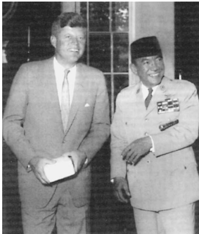
Indonesian President Sukarno with President Kennedy in 1961. Sukarno, a great admirer of Abraham Lincoln, understood that the concept of "self-determination" could easily be used as a tool of colonial control, by dividing a nation against itself. He insisted that nationalism must embrace the nation as a whole, while providing each citizen with the means to participate in both national and international affairs.

This latter view was given a theoretical cover, known as "developmentalism," associated with Raúl Prebisch, an Argentine economist who headed the UN Economic Commission for Latin America. Prebisch had an extensive resume as a British asset—he had negotiated a treaty between England and Argentina in the 1930s, which tied Argentina to debt payments during the depression, even while other Latin American countries declared debt moratoria. Then, in the 1950s, after the overthrow of nationalist Juan Peron, he collaborated with the Bank of England to scrap Argentina's National Bank, in favor of a British-style Central Bank. His "Developmentalism Theory" rejected the development of