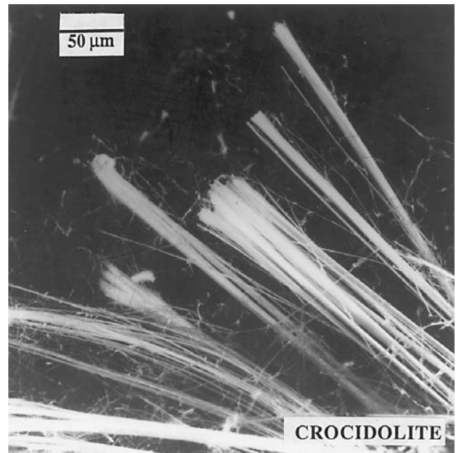
Highly magnified views of two types of minerals classified as asbestos: The photo on the left shows the mineral chrysotile (“white” asbestos), which is typical of the type mined in the United States and Canada. This type is used in 95% of asbestos products in the United States. The photo on the right shows the mineral crocidolite (“blue” asbestos) from North Cape, South Africa. Note the soft, “spaghetti”-like appearance of the white asbestos fibers as contrasted to the harder splintered fibers in blue asbestos. Studies have shown that significant exposure to blue asbestos can cause mesothelioma (cancer of the chest cavity lining), whereas exposure to white asbestos does not.

reported that reusable handkerchiefs could be made of asbestos, which could be cleansed and whitened with fire. It was also used at the time as a wick for oil lamps (in fact asbestinon , the original name given to this mineral by Pliny the Elder, means “unquenchable”). This was the secret of the Vestal Virgins’ eternal flame at the shrine of Vesta. Later, in the ninth century, Emperor Charlemagne had a tablecloth made of asbestos that he threw into the fire and pulled out unharmed to impress his dinner guests. In the 1820s, an Italian businessman named Giovanni Aldini created a line of ready-to-wear fireproof apparel, designed specifically for urban firemen. With the advent of the first industrial revolution, asbestos’s fireproof properties became a crucial element in the development of the steam engine. Mixed with rubber, it proved an ideal material for internal components like gaskets and packings.