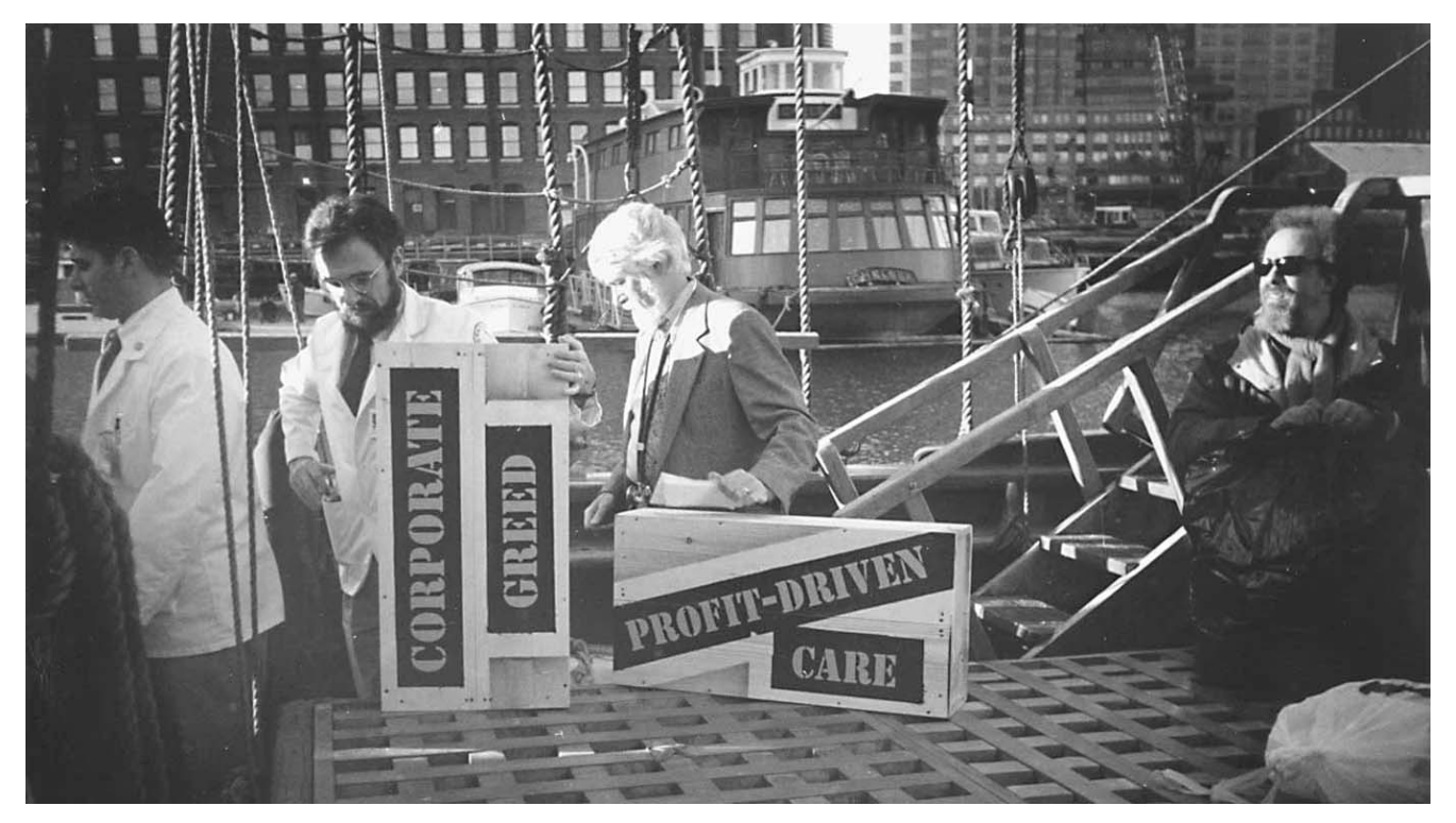
Members of the Ad Hoc Committee to Defend Health Care, at the site of the Boston Tea Party, throw crates of managed-care policies overboard.

most magnificent Movement of all'—an incident of dignity, majesty, and sublimity."