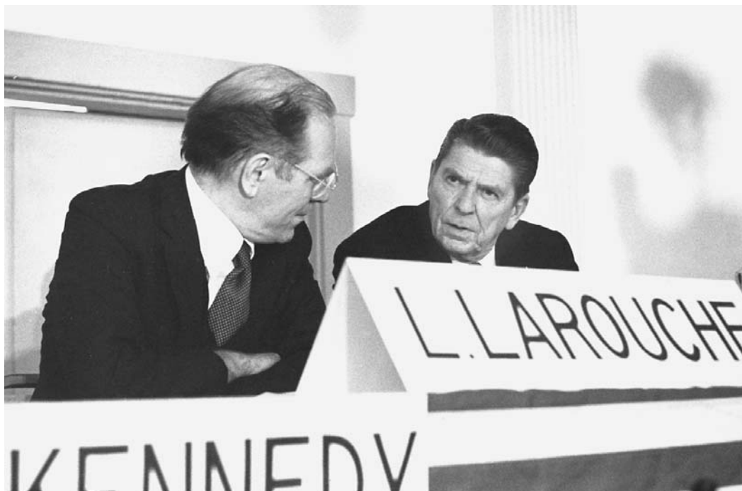
Lyndon LaRouche and Ronald Reagan chat during a candidates night in New Hampshire during the 1980 Presidential campaign. Key to the 1983-88 British-led effort to eliminate LaRouche, was LaRouche's major policy initiatives first introduced as a "plank" of LaRouche's campaign for the Democratic Party's 1980 Presidential nomination, a LaRouche policy later renamed by President Reagan as the "Strategic Defense Initiative" (SDI).

report, that was a joint asset of Her Majesty's Secret Service and the East German Stasi. On Oct. 19, 1977, Schleyer was assassinated, also allegedly by the Baader-Meinhof.