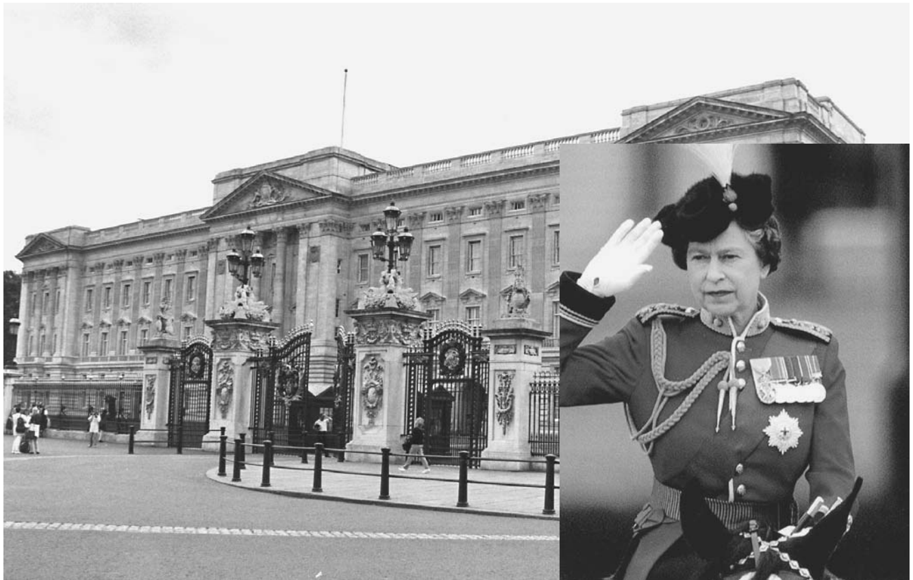
Queen Elizabeth II, and Buckingham Palace. The “Lizard Queen,” as some call her, is the Commander-in-Chief of British and Commonwealth forces worldwide, including a plethora of so-called “private” entities.

entire natural resources wealth of the planet. Since 1993, Central Africa has been targetted by the City of London-based Club of the Isles for end-game genocide, using colonial “gang versus counter-gang” tactics perfected during the post-World War II recolonization period by such senior British irregular warfare specialists as Brig. Gen. Frank Kitson. Kitson’s counterinsurgency textbook, Gangs and Counter-gangs , recounted his successful efforts in the 1950s in Kenya to create a synthetic, murderous “counter-gang,” the Mau Mau, which wiped out the legitimate nationalists struggling for independence from British colonial rule. Today’s African “Mau Mau” counter-gang leaders are Ugandan Hitler-loving marcher lord Yoweri Museveni, his Rwanda-based right-hand man, Paul Kagame, and their Congo stooge, Laurent Desiré Kabila. This murderous trio, as EIR has reported since 1994, is out to destroy all of the nation-states of the Great Lakes region and the Horn of Africa, purportedly to create a “Greater Tutsi Empire.” But behind these pawns stand the British Commonwealth cartels, controlled by 3-5,000 “Families” that comprise the inner core of the Club of the Isles. This is the modern-day