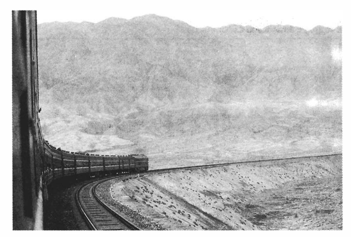
The Uighur separatists have vowed to destroy China's railroad infrastructure projects—a key aim of British geopoliticians. Here, the landscape along the main line Lanxin in northwestern China.

The Hague, the Netherlands, and bankrolled by the Dutch Foreign Ministry. Baroness Carolyn Cox's Christian Solidarity International, which is responsible for recent carnage in Central Africa of an intensity greater than the Nazi genocide during World War II, has targeted China, through a black propaganda campaign, charging that Beijing is butchering Christians.