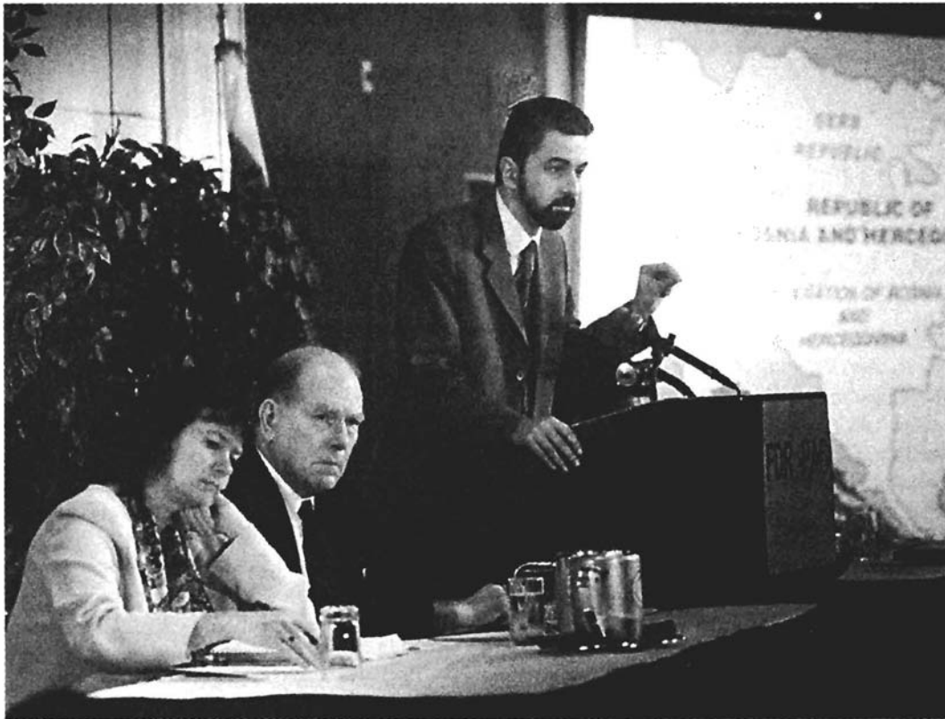
Bosnian leader Faris Nanic addresses the FDR-PAC in Washington on Jan. 4. To the left are Helga Zepp LaRouche and Lyndon LaRouche. Without economic reconstruction, Nanic told the audience, there will be no peace or stability in Bosnia-Herzegovina.

By reconstruction, we also mean modernization. Bosnia-Herzegovina is not one of the typical Third World countries that gained independence during the 1960s and 1970s. It is an industrialized nation. Of course, not at the level of western Europe, but it is an industrialized nation, a nation with a skilled labor force, with engineers, with experts in various fields, with a lot of industrial capacities that are partly damaged or devastated, but can be utilized. And, it's not a great effort to help Bosnia to recover itself from the devastations and the results of the war and aggression.