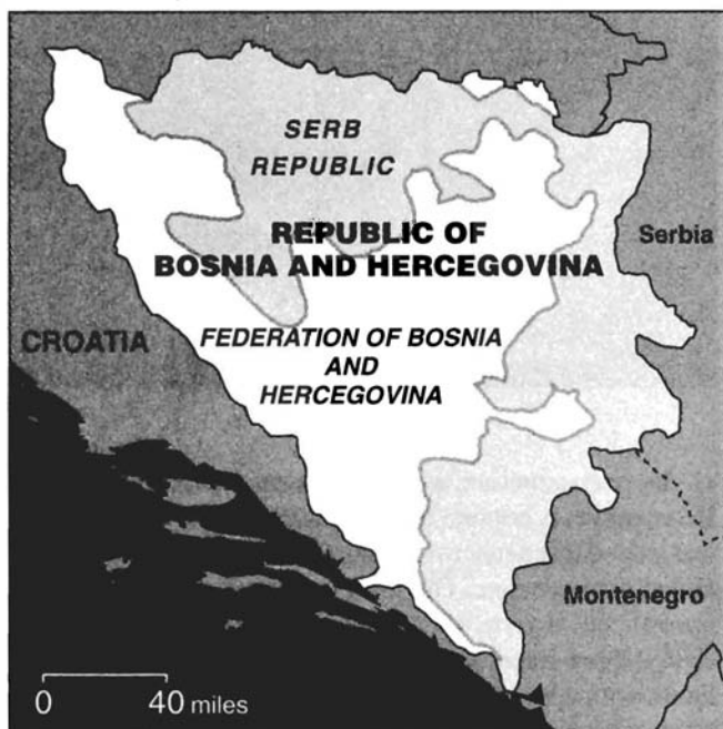
FIGURE 1 The Republic of Bosnia and Herzegovina

another, new war can easily break out, after the withdrawal of the international—now they call it SFOR troops.