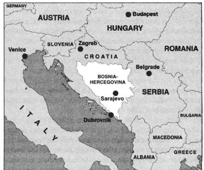
FIGURE 2 The Balkans

recover, to develop, greater than the expense of infinite military police and political presence of the international community in the region? Because, if you want peace there, if you want stability, without providing the things that I've just men-