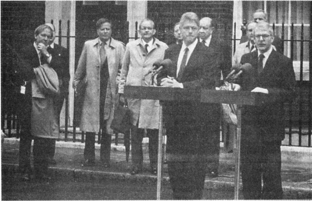
President Clinton with Prime Minister John Major in London, Nov. 29, 1995. The nominally closest allies of the United States today, are in fact its avowedly deadliest enemies: the Entente Cordiale of Britain and France.

operations inside Moscow and St. Petersburg, from 1989 to the present date.