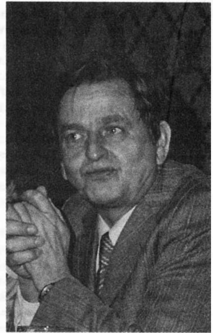
Victims of assassination by British-sponsored irregular warfare, left to right: Israeli Prime Minister Yitzhak Rabin, Deutsche Bank Chairman Alfred Herrhausen, Swedish Prime Minister Olof Palme.

during a period that other factions of Israel, such as the martyred Yitzhak Rabin and Shimon Peres, had become clearly Israeli patriots, concerned with long-term peace in their Arab neighborhood, Henry Kissinger crony and Likudnik butcher Ariel Sharon, were essentially, like the “Young Turks,” British agents and terrorists. London was not pleased with the Rabin-Peres government, and fabulously enraged by the Oslo accords struck between Peres and the Palestine Liberation Organization’s (PLO’s) Yasser Arafat.