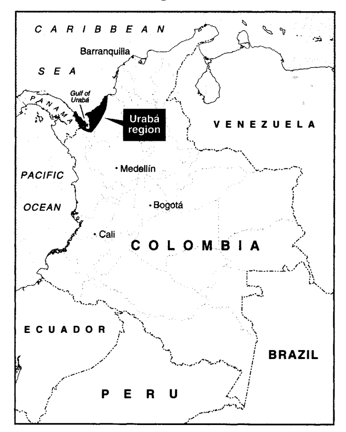
FIGURE 1 Colombia's Urabá region

from Mexico, through Central and South America, including the Antilles—everything south of the United States.