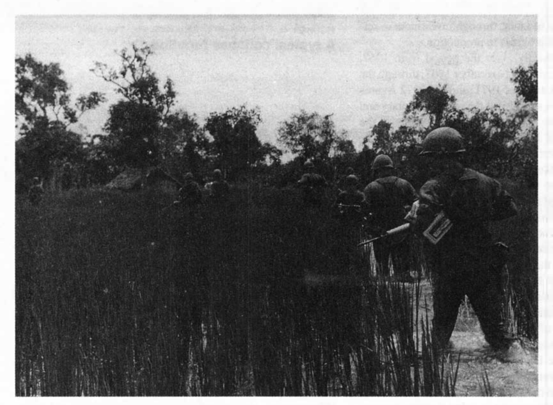
U.S. soldiers in Vietnam. September 1965. "Every night, on television, from the middle of the 1960s on," said Lyndon LaRouche, "you had battlefield pictures of American soldiers being shot to death, chopped to pieces, and so forth, on television. Under these conditions, what was induced in the United States (but not just the United States), was what was called a 'cultural paradigm shift.' "

thing that was done by the British faction in the United States was to collapse the mechanisms of economic growth in the United States, as a result of which, we had a recession from 1946 through 1948—very severe. It produced a politically dangerous demoralization among returning soldiers and their families. But from that point on, through to the present time, the United States has never had net economic growth, except in terms of mobilization for war, or for aerospace ventures. Every period of growth in the United States, since 1945, has depended upon the spillovers of military expenditures, or infrastructure development.