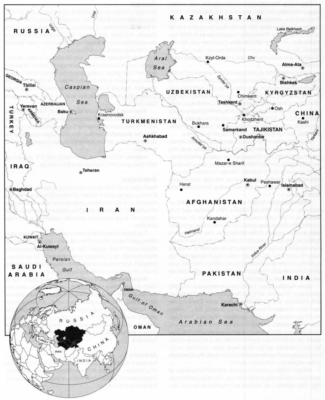
MAP 11 The Central Asian cauldron