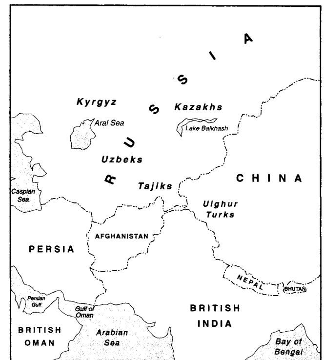
MAP 8 Central Asia in 1885