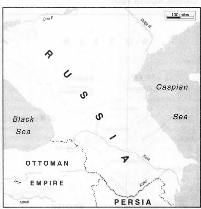
MAP 6 The Caucasus in 1864