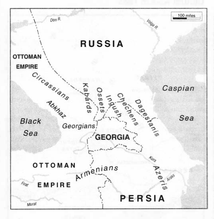
MAP 4 The Caucasus in 1763