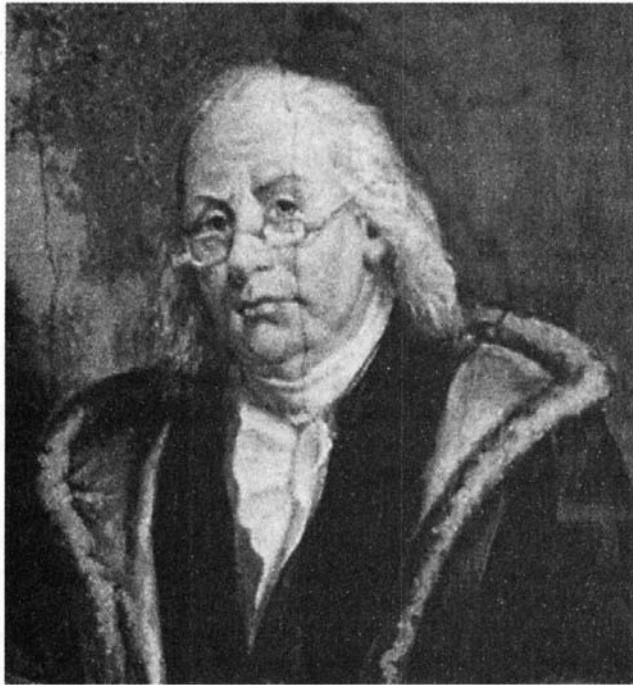
Detail of a portrait of Benjamin Franklin in the U.S. Capitol. Britain's "industrial revolution" began in 1758-75, with England's first canal-building, the invention of steam power, and modern chemistry and steel making. All this was organized by Benjamin Franklin and his close circle of friends.

state of Hanover, had been the protector of the philosopher Gottfried Leibniz. Her succession to the English throne was arranged by Leibniz and his allies, the pro-American republican circles of Irish statesman and author Jonathan Swift. But Sophie had died too soon, and her intended English crown was taken by her boorish son George I, a tool of the British Empire "Venetian party," the oligarchy that ran the slave and opium trades. George I died in 1727; his son George II, who died 1760, was succeeded by the infamous George III.