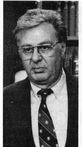
Rep. Dick Armey (Texas)