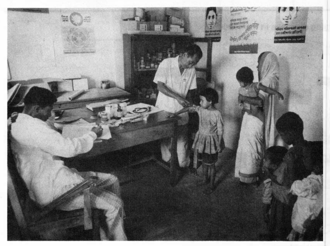
This clinic in Bangladesh provided inoculation against disease during the 1970s. Today, the International Monetary Fund has forced Third World nations to cut public health programs, water treatment, and mosquito control projects; the result is an enormous increase in epidemic disease, and public health officials are sounding the alarm.

The issue was revisited by EIR in a series of special reports warning of the consequences of the AIDS pandemic. In an April 30, 1985 Special Report , "IMF's Ecological Holocaust: More Deaths than Nuclear War," EIR reviewed much of the material that had been published in the previous decade. A series of exhaustive special reports on this topic followed.