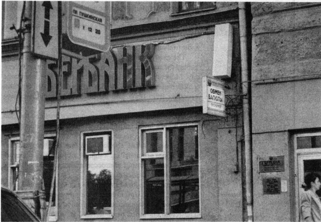
A branch of the Russian Federation Savings Bank (Sberbank), with sign advertising currency exchange. "The one-sided involvement of ordinary Russians in the credit system reduced possibilities for macroeconomic development, increases inflation, and impedes the course of market reforms."

The possibilities for stabilizing Russia's monetary system will depend on exchange rate behavior. Sharp, unpredictable exchange-rate fluctuations not only hit financial markets, but also lead to sharp changes in the profitability of export and import transactions. This, in turn, leads to significant changes in foreign trade volume and, consequently, supply and demand fluctuations on the domestic market. That is why regulation of the ruble's exchange rate must be a priority of Russia's economic policy. This is a major task, both from the viewpoint of raising the effectiveness of foreign trade and creating better conditions for foreign investors, and from the viewpoint of anti-inflationary regulation. To solve this problem, it will be necessary: