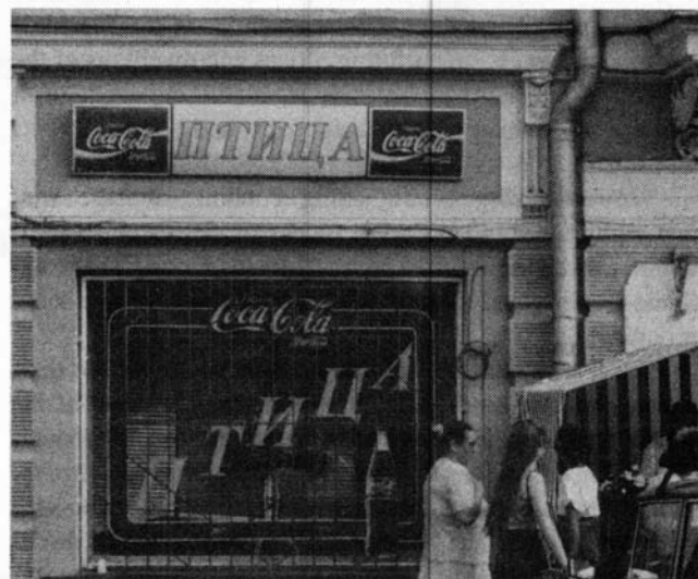
A poultry shop in Moscow: Low wages place its wares beyond the reach of a growing percentage of Muscovites. Writes Academician Lvov, “The wages workers receive now depend on factors which they can control to a smaller extent than before. This and other losses must be compensated. Otherwise, an increase of social tension and sometimes even direct conflicts with the authorities are inevitable.”

The crisis this country has encountered is of both an economic and a social and psychological nature. Such phenomena as apathy, cynicism, disappointment, and skepticism about the policy of reforms, and the population’s passivity during election campaigns are no less precise and direct indicators of the crisis than inflation and the collapse of pro-