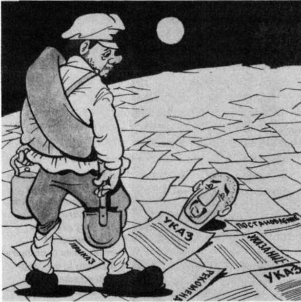
A recent cartoon from the Russian magazine Ogonyok illustrates a would-be financial and industrial group executive confronting a sea of decrees and regulations.

tries, only in a much more wasteful form? Development of the whole range of types and functions of credit is now retarded by the sluggishness of institutional changes in this area. The absence of procedures for using real estate as collateral in mortgage lending poses significant problems. Here, the macroeconomic problem of the economy's clearly underdeveloped credit potential intersects the problem of efficient property management. Another aspect of credit policy is the public debt. The population's financial assets (deposits in the Russian Federation Savings Bank and other banks, and government bonds) are now discussed only as an essential component of public savings, in the context of the macroeconomic conditions of the economy's investment potential. Meanwhile, these assets (which are liabilities of the government and banks) have no counterbalance in the form of indebtedness to the population, created through installment sale of consumer goods, provision of loans to finance housing construction on a turnkey basis, etc. This one-sided involvement of ordinary Russians in the credit system reduces possibilities for macroeconomic development, increases inflation, and impedes the course of market reforms in the economy.