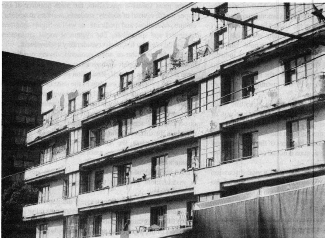
A crumbling residential facade in Moscow, June 1995. "The deterioration of socio-economic living conditions has led to a catastrophic demographic situation—a negative natural population growth."

What we had in our country was of quite a different nature. The rotten upper echelon of the non-democratic state headed up its "market restructuring," and thus won powerful positions and sources of enrichment for themselves and for far from the best economic management layers. For them, the most important thing was not reform, but power. As a result, there arose "failures in management," damaging the healthy elements of the planned economy. The next step was the substitution of a predatory and criminal free-for-all, for constructive market self-regulation. From this angle, the transformations of the economy and society, carried out under the banner of reforms, were the very thing the authorities were after: not to give their opponents any chance of seizing the levers of government. No change will take place, until the question of power is finally settled.