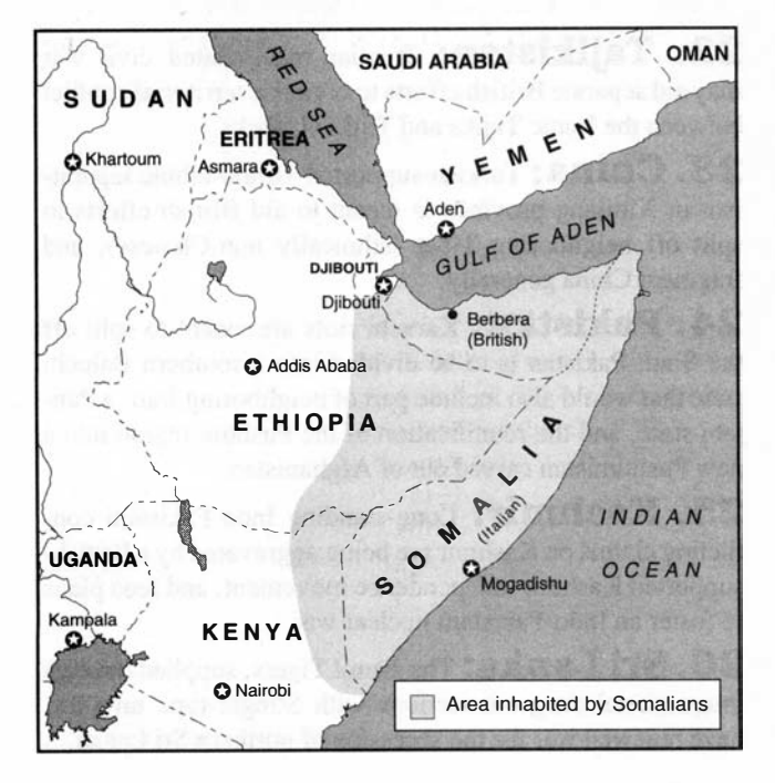
FIGURE 1 Horn of Africa, 1995

The result has been the political fracturing and economic decimation of the countries of the region. The primary target of Kissinger's mid-1970s Horn of Africa "switch" of sponsorship from the Ethiopia of Emperor Haile Selassie to the Somalia of President Siad Barre was Ethiopia. A nation of 30 million people, Ethiopia was a prime objective of Kissinger's National Security Memorandum 200 for forced population reduction. Perhaps even more dangerous to the British oligarchs and their partners, was that Ethiopia had produced an intellectual elite that was among the most competent in all of Africa. After years of war and famine under a violently antiintellectual Marxist regime, Ethiopia—now minus its former coastal territory Eritrea—is struggling to revive itself, with little aid from foreign donors. Reflecting the degree to which the elites of the country have relinquished even the concept of their nation, the new constitution of Ethiopia, voted up May 7, grants the right of any one region to secede at will and was heralded by London's Financial Times under the headline "Ethiopia Buries the African Nation State."