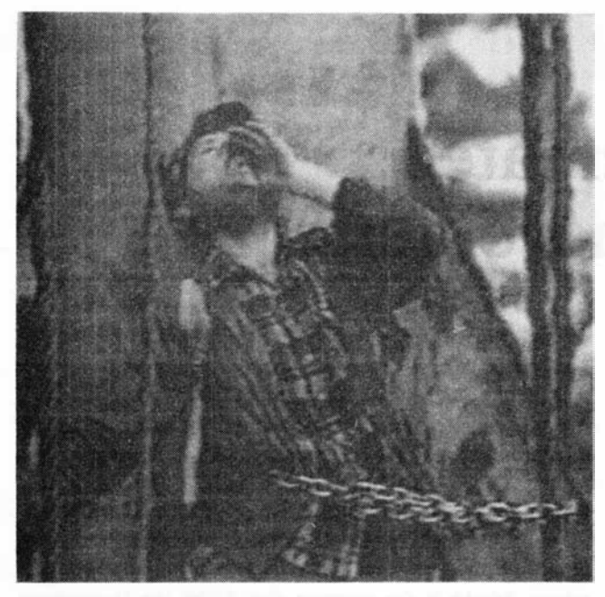
An Earth First! activist chains himself to a piece of equipment. The terrorist group was founded under the auspices of the "respectable" Wilderness Society and the Sierra Club.

late 1970s, he co-authored a widely publicized scenario about nuclear Armageddon, The Third World War: August 1985 .