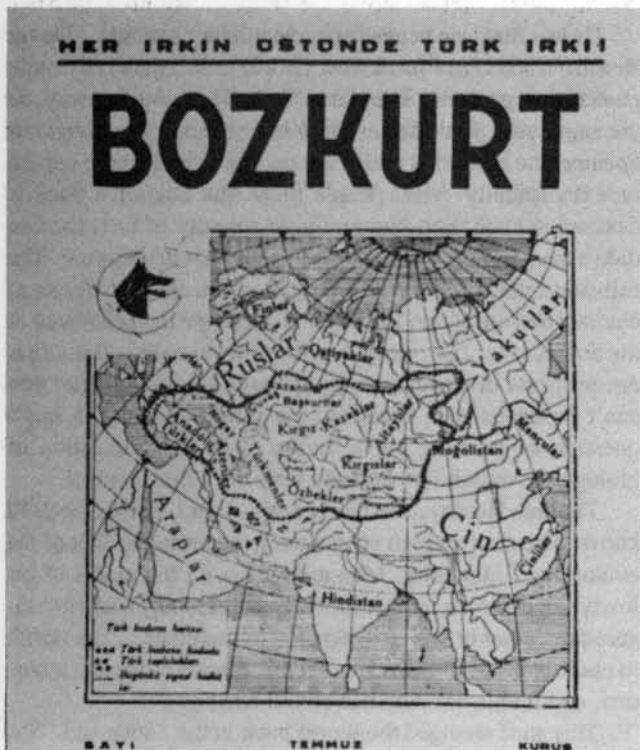
An example of Young Turk propaganda in favor of bringing all Muslims into a single empire.