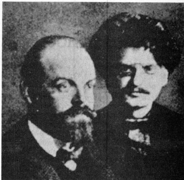
On the left is Alexander Helphand Parvus, the éminence grise behind the Russian revolutions of 1905 and 1917. Next to him is one of his useful fools, Leon Trotsky.

But who founded the Scottish Rite in Turkey? One of the founders was the grand master of the Scottish Rite in France,