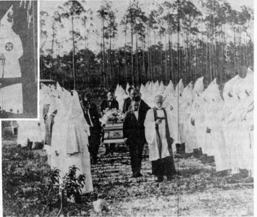
British and U.S. intelligence agencies, and private organizations such as the Anti-Defamation League, have a controlling interest in the Ku Klux Klan and similar organizations. The photos show a KKK funeral in 1924 and a KKK "baptism" of an infant, mock-Christian ceremonies conducted in the era when the Klan was committing ritual satanic murders of black people all over the U.S. South, with impunity—and when the Anglo-American elites were backing Nazi eugenics in Germany.

man revanchism." These European efforts, paralleling the ADL-CDR activities in North America, were always conducted in concert with the Association of Victims of the Nazi Regime (VVN), and more recently with the World Jewish Congress of Edgar Bronfman. The VVN, one of the so-called anti-Nazi groups formerly based in East Berlin, has been identified in the annual report of the West German Interior Ministry as being run by the Stasi, which was itself an intermediary for the disinformation section of the KGB.