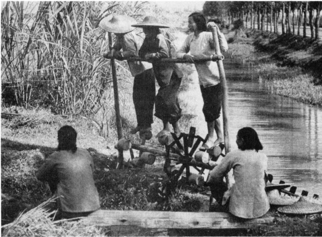
Chinese women using a foot treadmill—a 2,000-year-old technology—to raise water into an irrigation ditch. The British effort to destroy China's Confucian culture aimed at creating institutions like the Communist Party to sustain backwardness in that vast nation.

the barbarian military tactic of “scorched earth.”