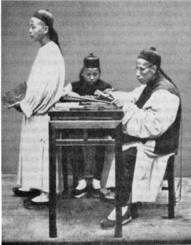
In this 1895 photo a student is repeating a Classical text by heart, called "backing the book." The rigorous Confucian examination system—open to all regardless of social status—required the student to produce essays on benevolence and statecraft.

and Austria. But . . . China does not want to declare war on either side."