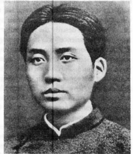
Bertrand Russell (left), worked to destroy the common Confucian and Christian world view of man in the image of God, and replace it with a bestial image of man driven by greed. He laid the basis for the emergence of the Chinese Communist Party. Shown at center and right are Communist Party founders Chen Duxiu and Mao Zedong, whose early education was based on Russell's instruction in British empiricism and Bolshevism.

the West. He believed that the superior level of morality of the Confucian world view within China explained why Mongol and Manchurian invaders, even after conquering China, were themselves assimilated into Chinese culture, rather than their inferior culture having been imposed upon the Chinese.