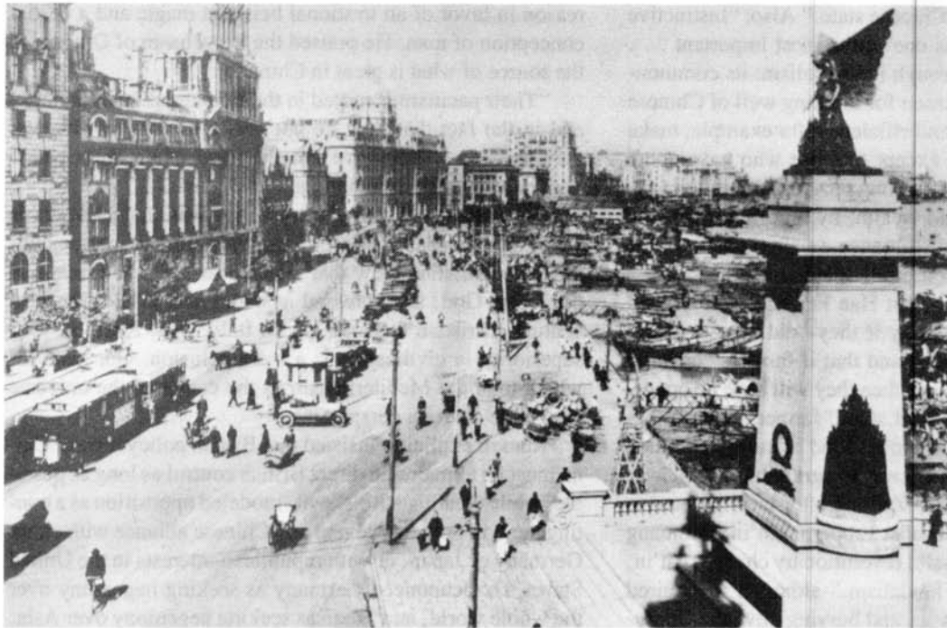
Shanghai's international settlement. As the British colonialists and free traders extended their control over China, they built this modernized metropolitan center for themselves, while imposing crushing poverty via reparations and debt payments on the rest of China.

of Dewey's "pragmatism." To Dewey and his followers, "scientific method" meant the elimination of human reason and natural law from scientific inquiry, adopting instead a purely mechanical and statistical description of phenomenon. Dewey's disciple Hu Shih, like the Legalists, defined "truth" as totally relative, to be adopted at the whim of those in power. Said Hu: "Truth is created by and for the use of man. . . . An idea which had fruitful consequences was called truth in the past. If it has been useful, it is still called truth today."