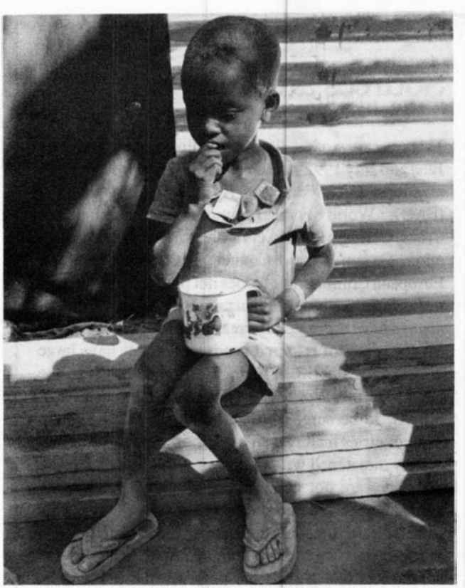
Refugee child sips milk in the Guri-Ely refugee camp in the Beledweine District of Somalia. At least 4.5 million Somalians are in need of emergency food assistance today, while the U.N. plays cynical power games.

"Every one of the 40 million people who are now acutely threatened with starvation, feel pain and suffering just as you and I do. Every one of the children threatened with death, has the right to laugh and frolic. Therefore, how we react to those catastrophes in Africa, is a measure for our own moral capacity to survive."