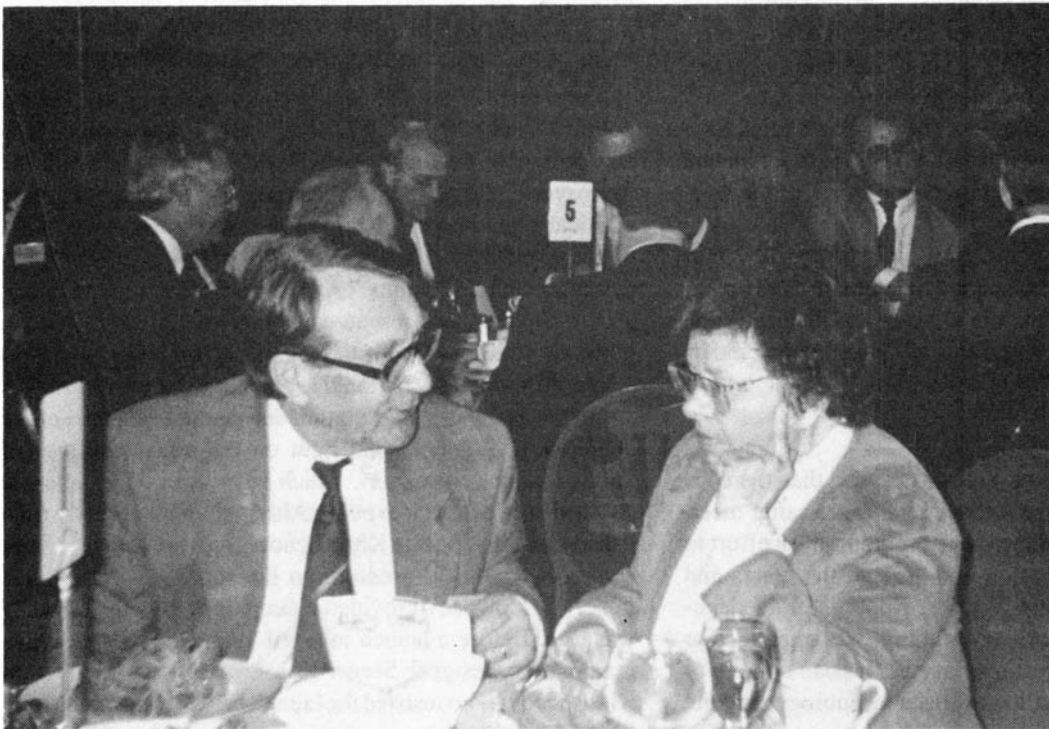
Former director of the Soviet Space Institute in Moscow, Roald Sagdeev, meeting with Maryland Sen. Barbara Mikulski at the April 9 Goddard Memorial Symposium in Washington. Sagdeev is now a physics professor at the University of Maryland.

countries have resources, they have a work force, too, but they do not have science or expertise. . . . If we destroy science we shall never rebuild it. . . . Then we will have no future. . . . Science is an interpublic phenomenon. . . . Science is a very delicate instrument, and it is now collapsing very quickly." Science is also international, and should be considered an international responsibility, Velikhov and the leadership of the former Soviet scientific community have been more recently trying to impress on U. S. policymakers.