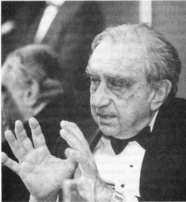
Physicist Edward Teller. A life-long ardent anti-communist, Teller has been in the forefront of demands for joint U.S.-CIS efforts to preserve both the vast Soviet scientific physical capability and its highly trained manpower pool.