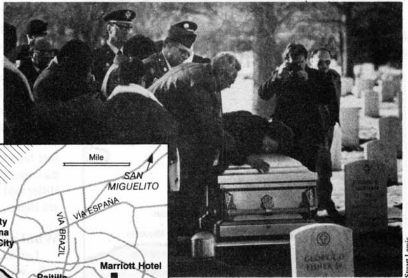
The Dec. 28 burial in Arlington National Cemetery of the first American GIs who died in Panama to satisfy the President's obsession.

The map shows the Chorrillo quarter of Panama City, leveled "like Hiroshima" by the invaders—where most of the population is poor and black. The other devastated neighborhood, San Miguelito is located to the left of the area in this map, and has gone mostly unmentioned by U.S. press.