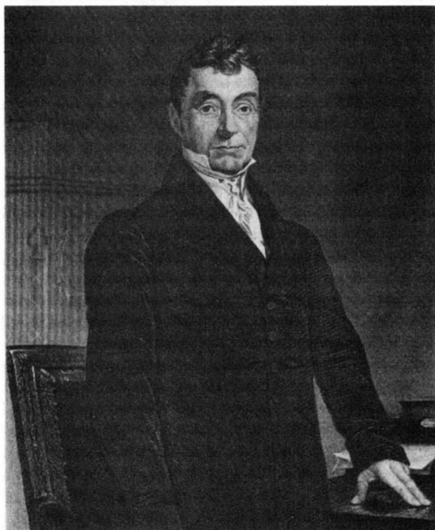
The French patriot Marquis de Lafayette during his 1825 grand tour of the United States, when he was accompanied by the young List. This engraving is based on a portrait by American artist, inventor and patriot, Samuel F. B. Morse.

During this second stay in Paris, List presented his plan for the national economic development of France: the simultaneous and interconnected creation of 1) a national system of railways, 2) a national paper currency, and 3) commercial banks. His idea was to create favorable conditions for investment in railways through the issuance of money, whereby the commercial banks could be assisted in the creation of this credit. This plan had the marvellous advantage that it bypassed, nay, it short-circuited the Paris-based but Geneva-