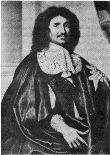
Left: French minister Jean-Baptiste Colbert (1619-83) put science to work to develop the nation-state; right: Austrian Chancellor Clemens von Metternich (1773-1859) dedicated his life to suppressing science and national freedom.