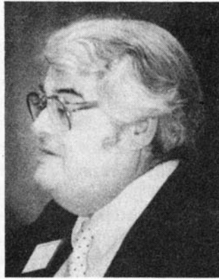
Dr. Norbert Brainin