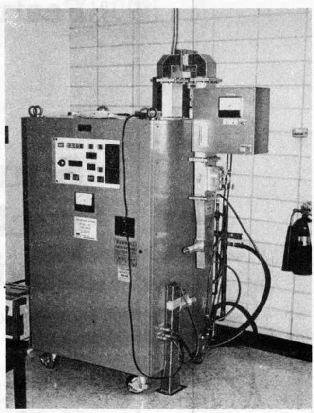
In the "proof of principle" experiment the grasshoppers were placed inside the "head inactivator" pictured above. Such devices were developed by researchers who wished to rapidly inactivate the chemical processes going on in the brains of small research animals such as mice in order to study the metabolism of neurological reactions in anatomically specific areas of the brain. Some of the specific features of the instrument are described in the text.

"This work demonstrates that if electromagnetic energy sufficient to cause a temperature rise to around 50°C is applied to insects such as grasshoppers or locusts, irreversible damage resulting in death occurs. Energy absorbed is about