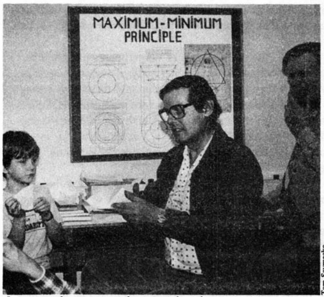
Instructor demonstrates the principles of constructive geometry, including the "Maximum-Minimum Principle" of Nicolaus of Cusa, the founder of modern physical science.

is to bring to the highest relative degree of general development, those creative potentials of the individual which set mankind above the beasts. Youth so developed represent the optimal capability for effective response to whatever challenges higher education, employment, and adult life generally may present to them.