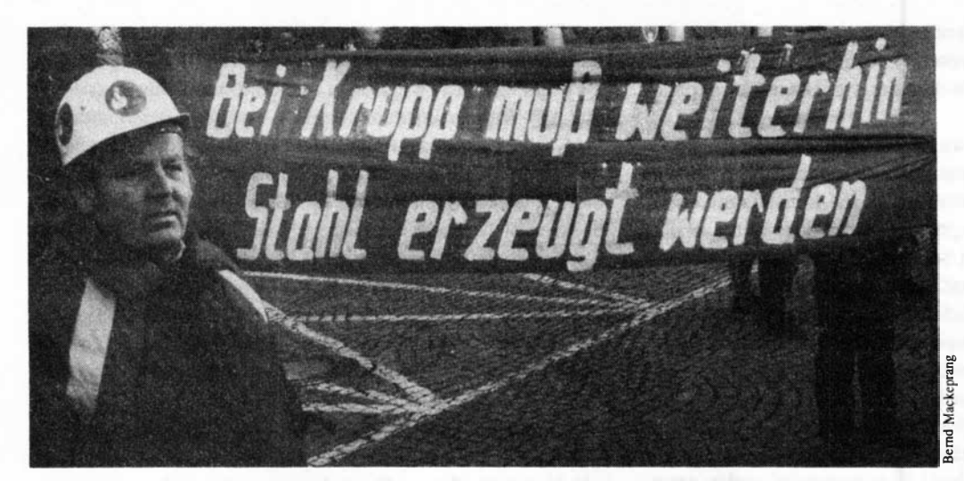
Steelworkers demonstrate in Rheinhausen against the planned closing of the Krupp steel plant, December 1987. The banner reads, "Krupp must keep on making steel."

The reason for this was rather clearly understood by the middle of the 16th century. The mercantilist current in England, including Thomas Gresham, fostered the use of the power of the royal government to issue patents, under whose terms inventors and their business partners enjoy a limited period of monopoly on the production and sale of useful inventions. Western civilization's strength is our special view of the development and employment of the creative powers of reason of the individual personality; to encourage this, and to give it the greatest latitude possible or tolerable, is an intrinsic part of our civilization's superior genius for generating and assimilating the benefits of scientific and technological progress.