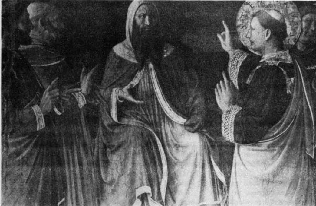
Creative reason versus irrationalist rhetoric as seen by the Italian Renaissance artist, Fra Angelico, ca. 1450. The scene portrayed is St. Stephen's sermon to the enraged Sanhedrin, as described in the Acts of the Apostles, 6-7. (Vatican Palace, Chapel of Nicholas V, Rome.)

the human mind is incapable of an intelligible representation of the mental processes by which such results as valid fundamental discoveries in physical science are effected. Kant's argument, which he deceives himself to be proof of his assertion, is based on the fact that the transitive verb "to create" can not be represented in an axiomatic-deductive mode of formal logic.